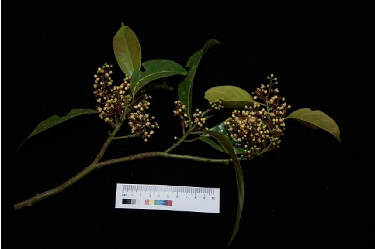
Flowering branchlet of Endiandra macrocarpa .