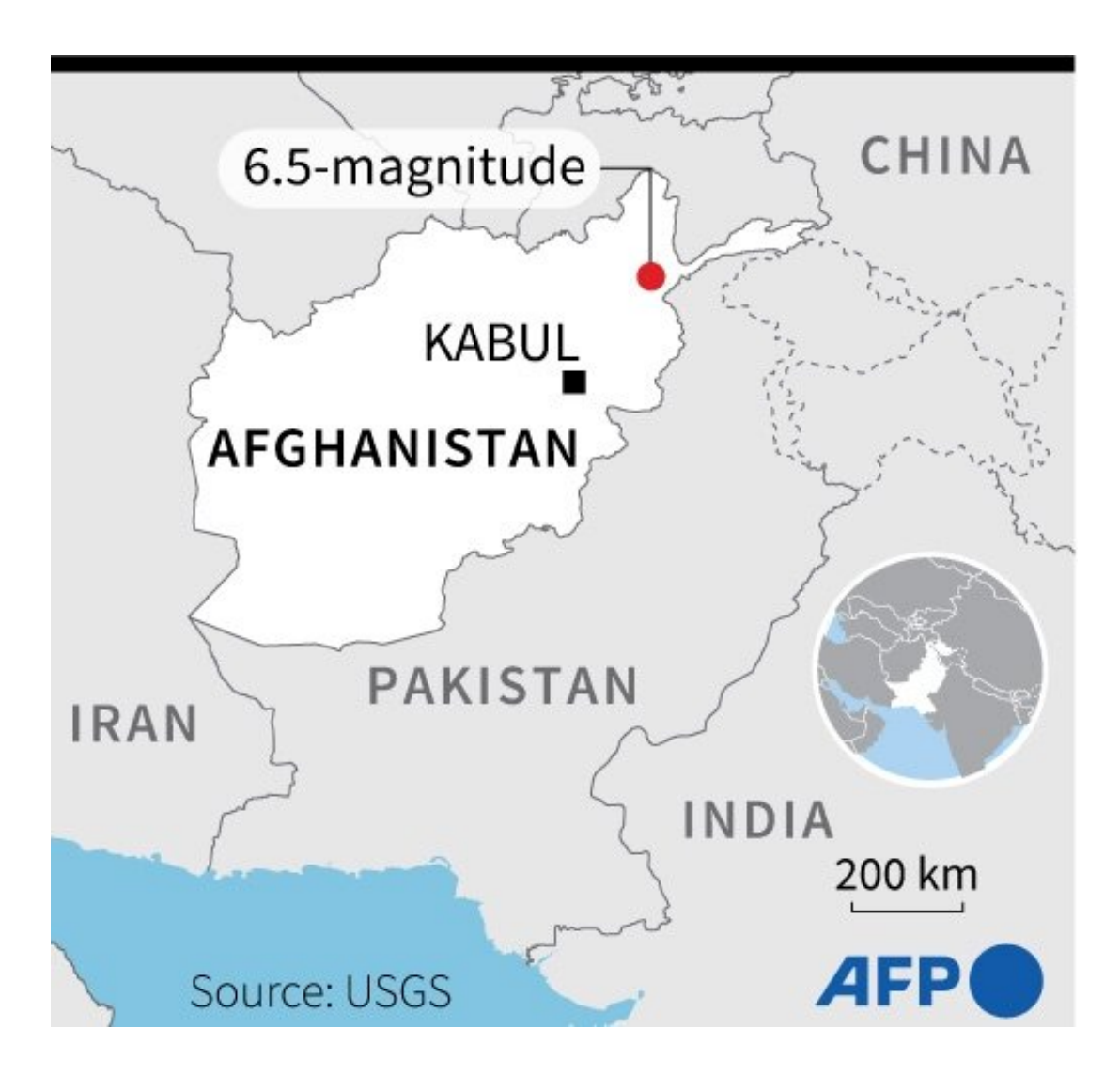
Map of Afghanistan and the surrounding region locating the earthquake on March 21.

"It's possible that there could be another tremor so I'm still waiting outside."