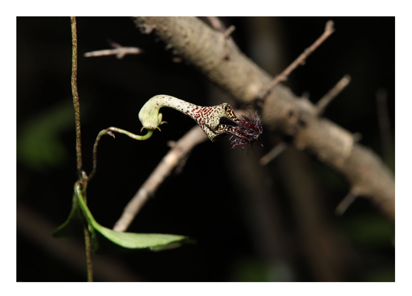
Ceropegia eshanensis.

Throughout the whole expedition, only one population of Ceropegia eshanensis was found, sporadically distributed in semi-humid evergreen broadleaf forest and twining around branches in the thickets near Fawu Village in Eshan. Its habitat is inevitably disturbed by local villagers.