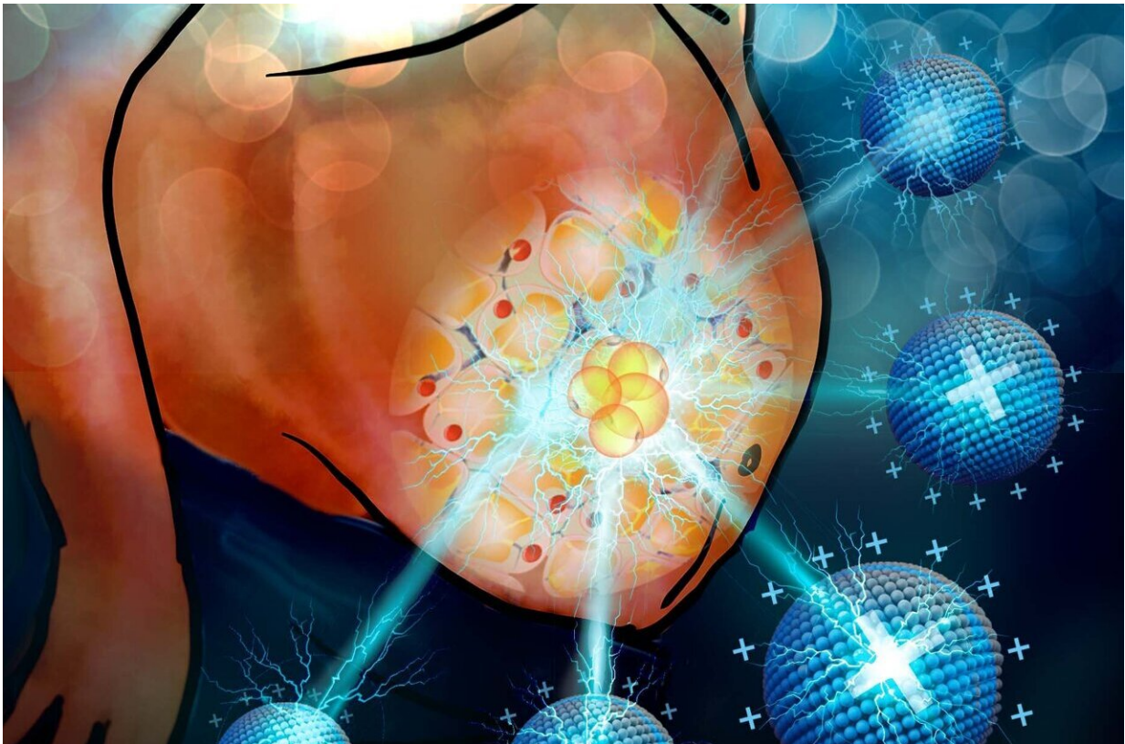
Illustration of depot-specific targeting of fat by cationic nanomaterials.

cells, a technique no one has ever used to treat obesity. I think this novel strategy will open the door to healthier and safer reduction of fat."