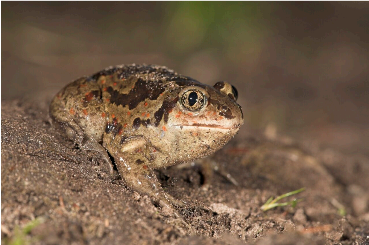
Spadefoot toad ( Pelobates fuscus ).

for example in Meijendel, with a genetic profile originating from Greece. In addition, there also turned out to be Italian tree frogs in the Westduinpark near The Hague."