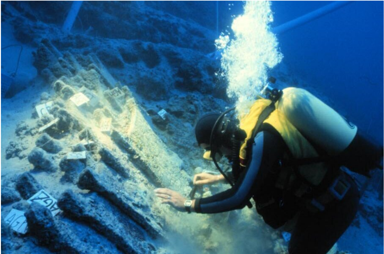
Uluburun excavation i.