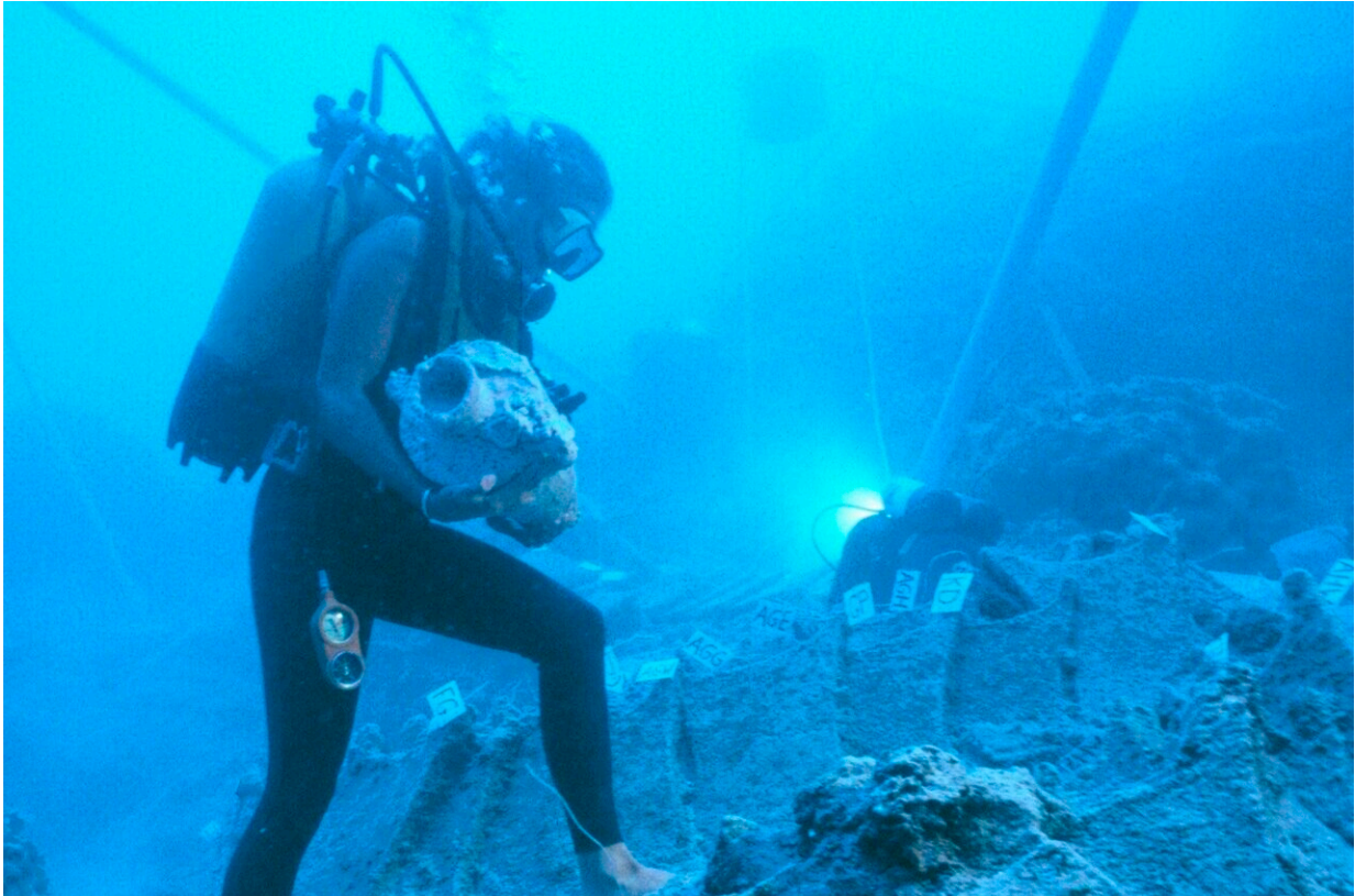
Uluburun excavation images showing copper oxide ingots.