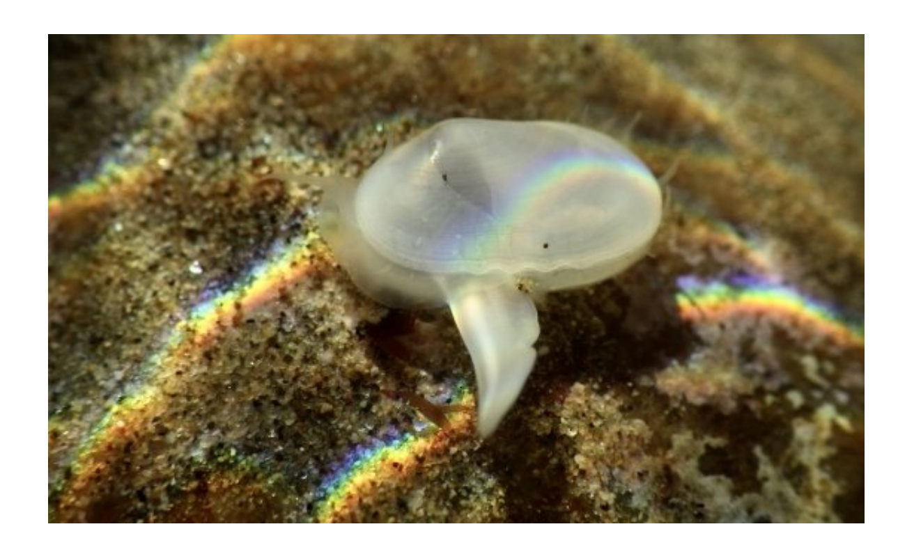
A dazzling play of colors highlights Southern California's long lost clam.

Discovering a new species is always exciting, but so is finding one alive that everyone assumed had been lost to the passage of time. A small clam, previously known only from fossils, has recently been found living at Naples Point, just up the coast from UC Santa Barbara. The discovery appears in the journal Zookeys .