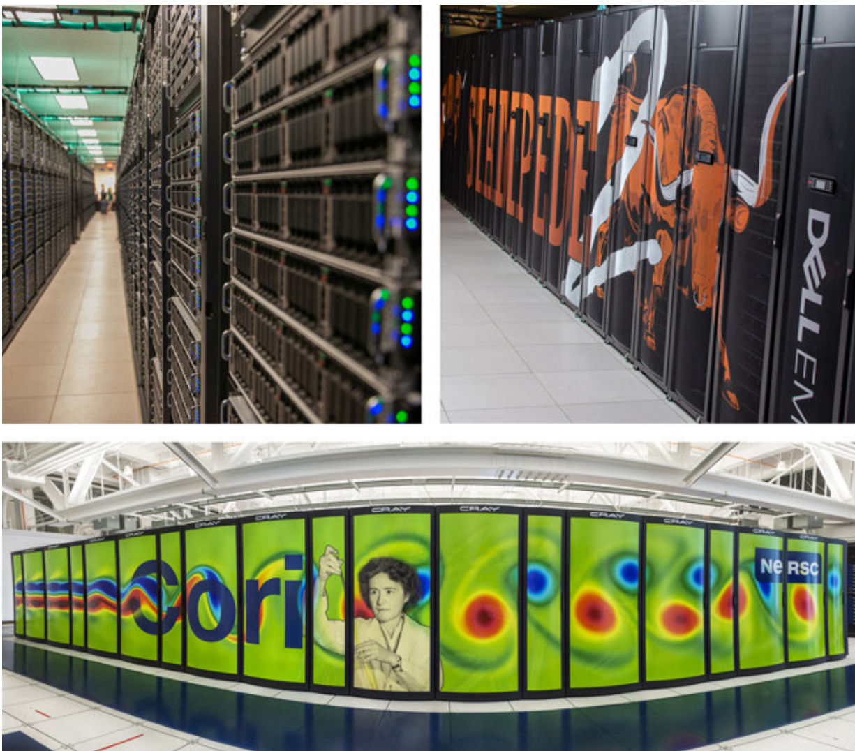
Supercomputers used in exciton research: TACC's Frontera (upper left) and Stampede2 (upper right). NERSC's Cori (lower panel).