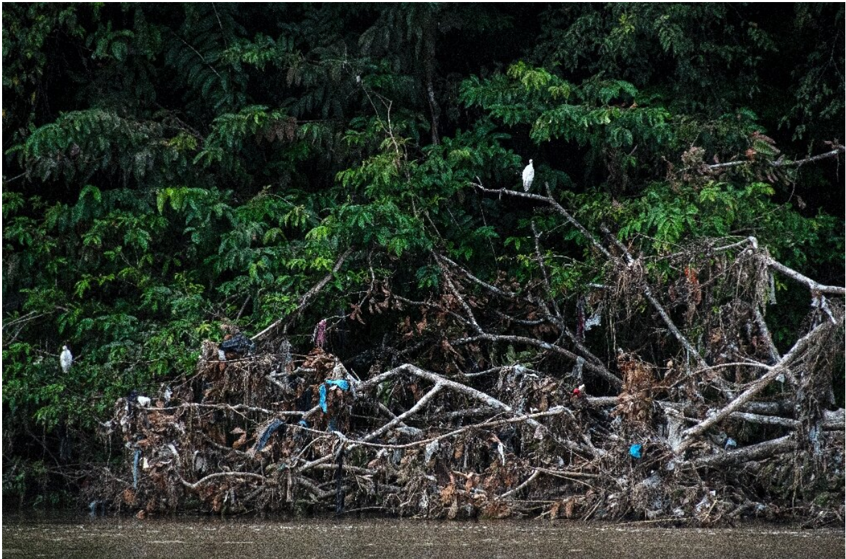
Birds perch amid garbage-strewn branches on the Tarcoles River.

Costa Rica has impressive environmental credentials, with a third of its territory marked for protection, 98 percent renewable energy , and 53 percent forest cover, according to the UN's environmental agency.