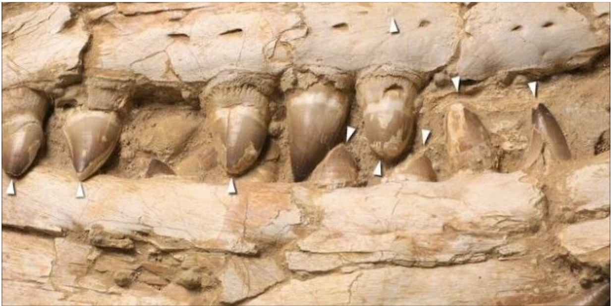
Thalassotitan teeth.

Sixty six million years ago, sea monsters really existed. They were mosasaurs, huge marine lizards that lived at the same time as the last dinosaurs. Growing up to 12 meters long, mosasaurs looked like a Komodo dragon with flippers and a shark-like tail. They were also wildly diverse, evolving dozens of species that filled different niches. Some ate fish and squid, some ate shellfish or ammonites.