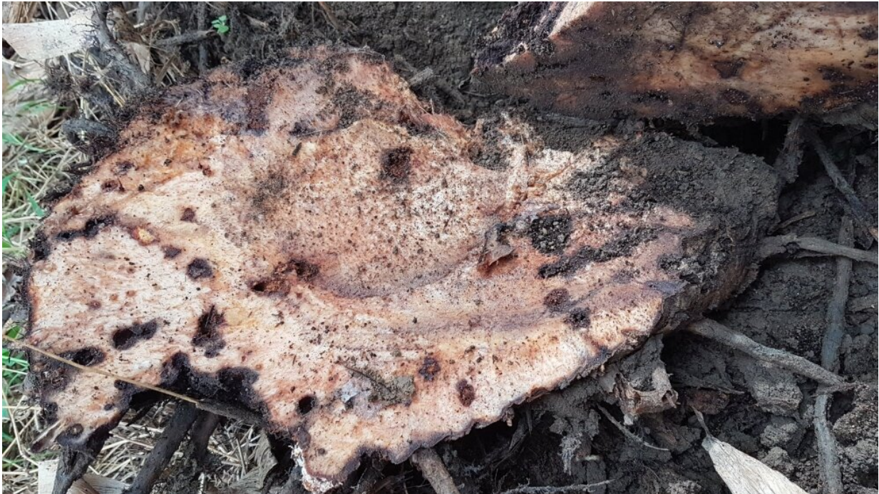
Banana rhizome damaged by borer weevils.