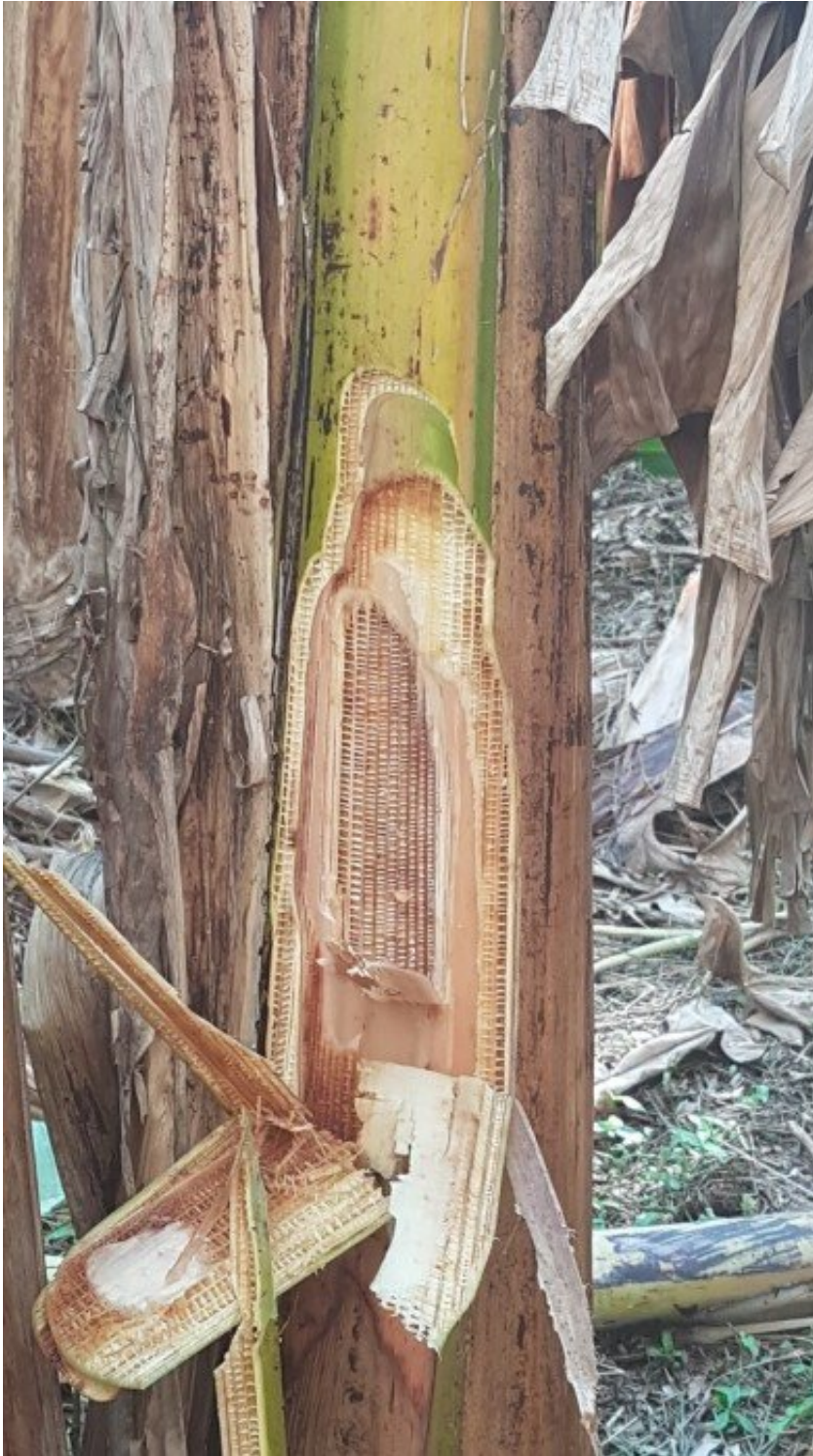
Damage to banana pseudostem attacked by Fusarium wilt.