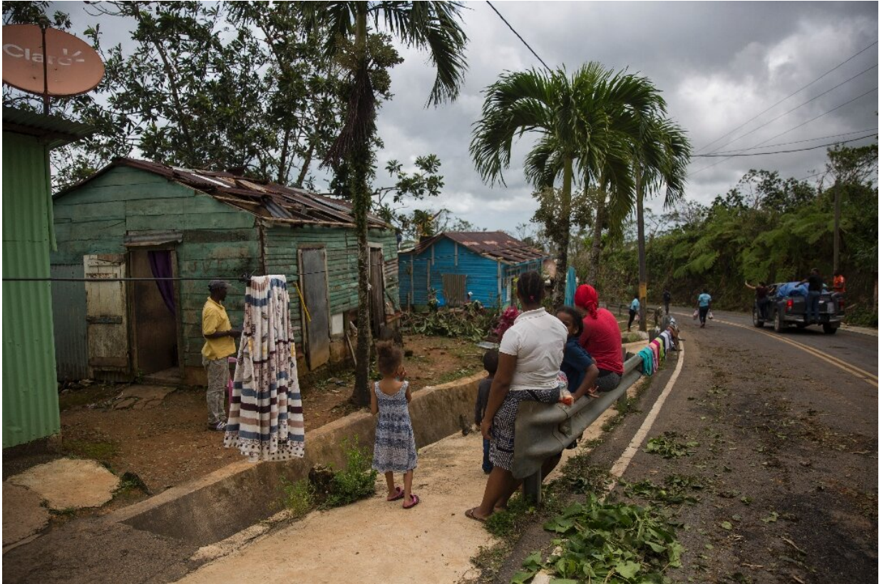
Residents are seen outside their homes in northeast Dominican Republic on September 21, 2022 after the passage of Hurricane Fiona.