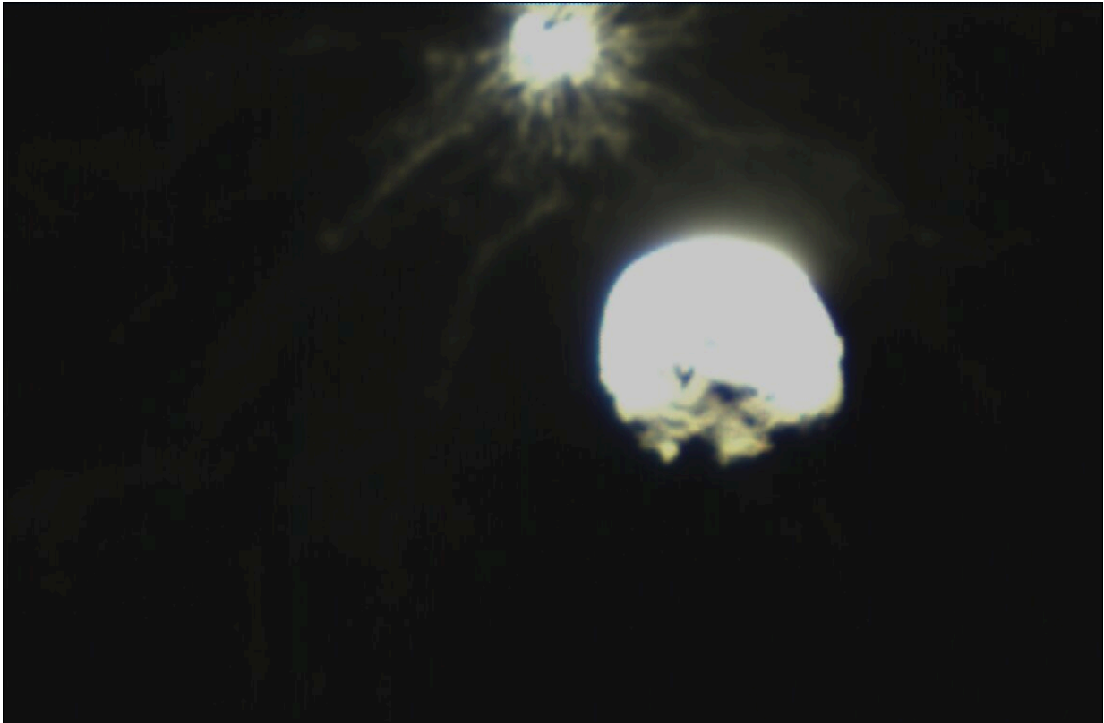
Image captured by the Italian Space Agency's LICIACube a few minutes after the intentional collision of NASA's Double Asteroid Redirection Test (DART) mission with its target asteroid, Dimorphos, captured on Sept. 26, 2022.

While Dimorphos is 11 million kilometers (6.8 million miles) away and poses no threat to Earth, it is being used as a historic test run so the world can be ready to defend itself if a future asteroid heads Earth's way.