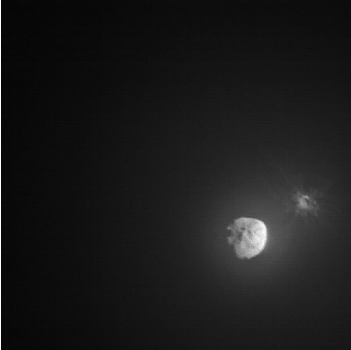
Image captured by the Italian Space Agency's LICIACube a few minutes after the intentional collision of NASA's Double Asteroid Redirection Test (DART) mission with its target asteroid, Dimorphos, captured on Sept. 26, 2022.

"We have a quantity of ejected matter that is quite incredible."