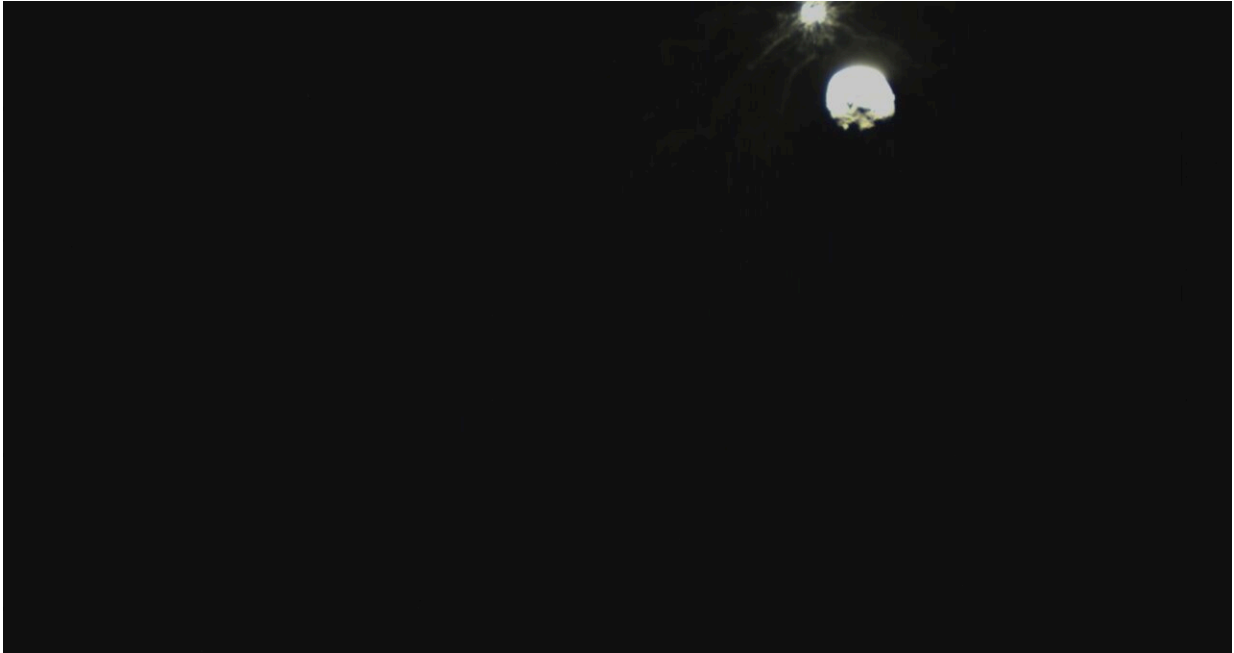
Image captured by the Italian Space Agency's LICIACube a few minutes after the intentional collision of NASA's Double Asteroid Redirection Test (DART) mission with its target asteroid, Dimorphos, captured on Sept. 26, 2022.

Then the European Space Agency's Hera mission will arrive at Dimorphos in 2026 to survey the surface and discover the extent of DART's impact.