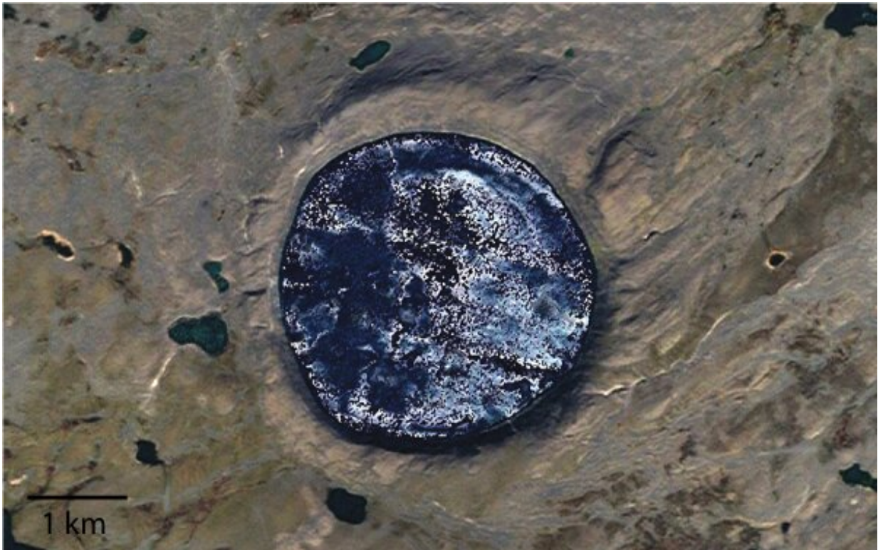
Figure 2: Pingualuit crater lake in Canada is a modern-day example of a cold impact crater-hosted lake on Earth analogous to ancient crater lakes on Mars.

Lakes contain water, nutrients and energy sources for possible microbial life, including light for photosynthesis. Therefore, lakes are the top targets for astrobiological exploration by Mars Rovers such as NASA's Perseverance rover now on Mars. But Michalski warns, "Not all lakes are created equal. In other words, some Martian lakes would be more interesting for microbial life than others because some of the lakes were large, deep, long-lived and had a wide range of environments such as hydrothermal systems that could have been conducive to the formation of simple life." From this point of view, it might make sense to target large, ancient, environmentally diverse lakes for future exploration.