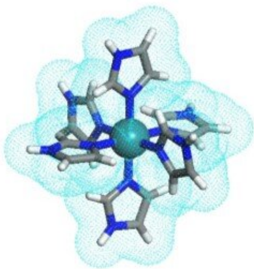
Fig 1. Imidazole-imidazolate metal complex

Researchers develop a highly symmetric ruthenium (III) complex with six imidazole-imidazolate groups for efficient high-temperature proton conduction in fuel cells.