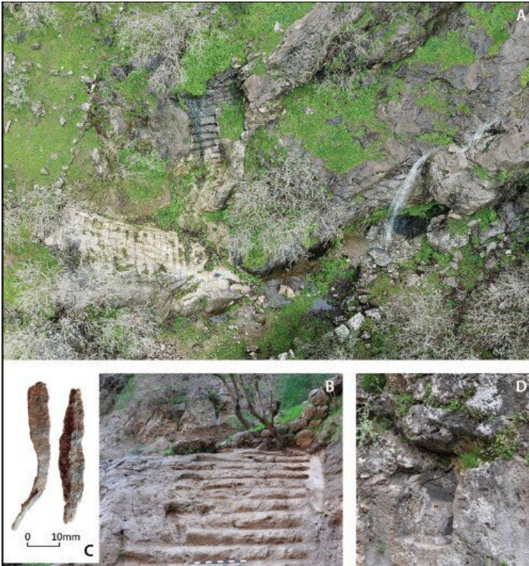
A) Rabana "sanctuary"; B) staircase; C) iron arrowheads; D) altar (scales = 1m).

The researchers also found a religious complex possibly dedicated to the Zoroastrian Iranian goddess Anahita. The rock reliefs at the entrance to the fortress are of special significance, along with the geographic location of the fortification in the catchment area of the Lower Zab