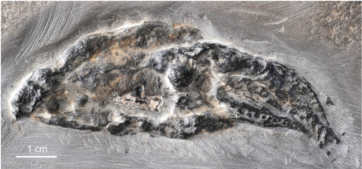
Photograph of one of the fossil Vampyronassa rhodanica specimens in this study.

The imaging revealed previously unknown details regarding the suckers and arm crown. Comparison with tomographic data of an extant V. infernalis specimen scanned at the American Museum of Natural History in New York allowed the team to determine that the suckers and cirri of V. rhodanica were proportionately more robust than those of V. infernalis . The researchers also noticed that the configuration of the suckers and cirri on the longer dorsal arm pair was different than on the rest of the arms.