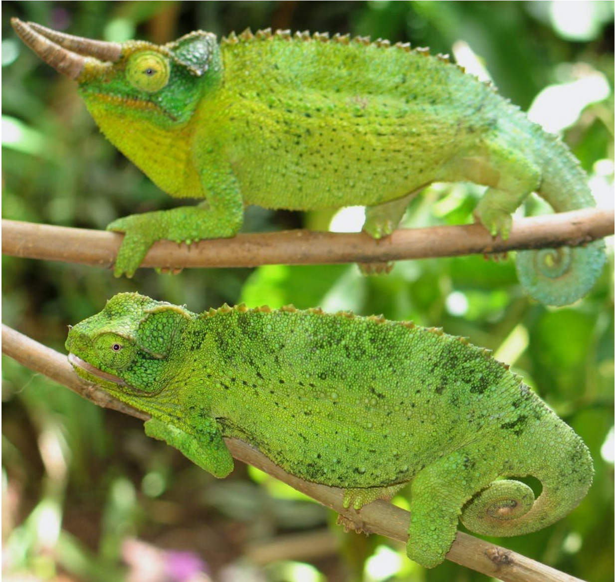
A male Jackson's three-horned chameleon (above) courting a female (below) in Kenya.