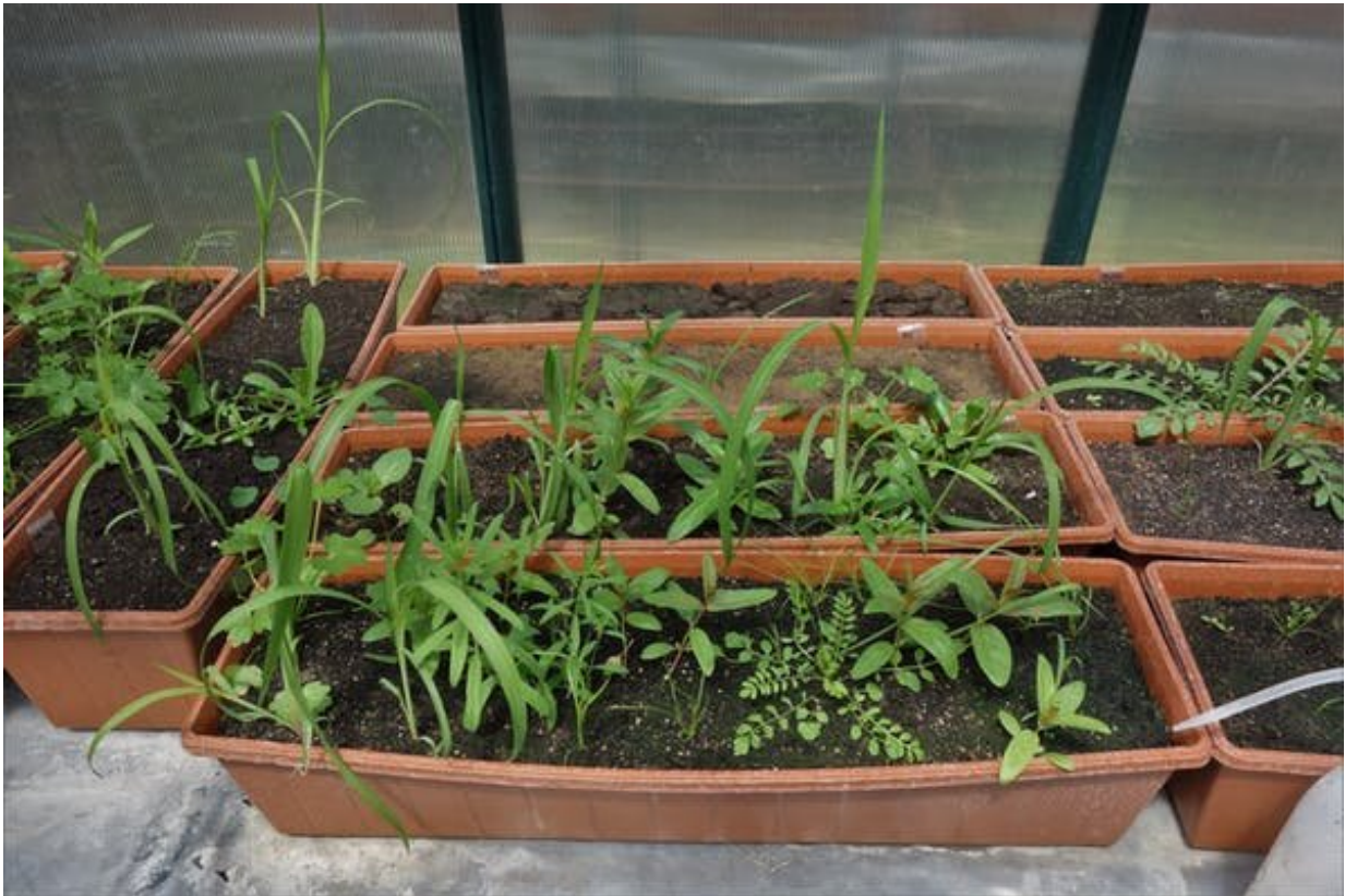
Plants growing in the samples of potting soil.

6 species. An average 20-liter bag of soil bought from a garden center could contain around 265 viable seeds. The seed content of each potting soil varied widely, as soils with manure contained a substantially higher number of species and seeds than soils without it. This suggests that long-distance dispersal happens as a result of grazing livestock eating and passing seeds, and people adding the seed-rich manure to potting soils, which they transport and use over great distances. The diet preferences of the grazing animals producing manure for potting soils influences the ability of a plant species to be dispersed this way.