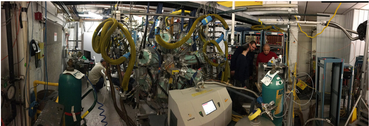
The GADGET detector.

Scientists have since learned that novae are not new stars , but distant extant stars that become visible on Earth when they explode or trigger explosions. Perhaps the best-known example of a "new star" is a supernova, which is when an entire star explodes. In our galaxy, the Milky Way, this is comparatively rare, happening once every hundred years or so.