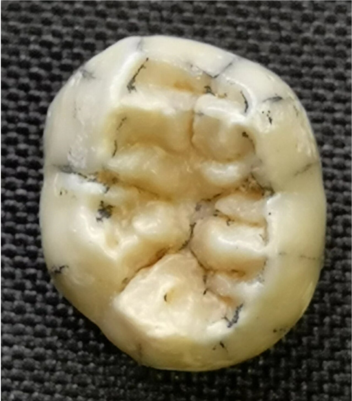
A close up of the tooth from a 'birds-eye' viewpoint.