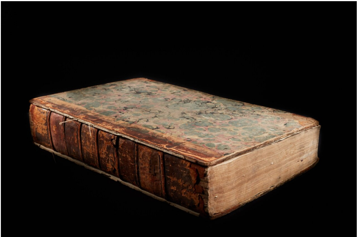
Printed Prize Appeals (TNA, HCA 45).

55 so-called case books. These comprise printed copies of documents from appeal cases that were held between 1793 and 1815 and are related to the prize appeals and evidence of approximately 1,500 captures, originally heard at the High Court of Admiralty in London or the assigned Vice-Admiralty Courts in the colonies, including those in the Caribbean and the Northwest Atlantic. Two-thirds of all appeals in this time came from the United States. The more than 57,000 photographed pages are linked to trials that were held during the French Revolutionary War or the Napoleonic Wars. "The case books serve as an excellent point of entry into the historical period, as well as the global systematic capturing of merchant ships," says Dr. Amanda Bevan, head of The National Archives' Prize Papers team located in London.