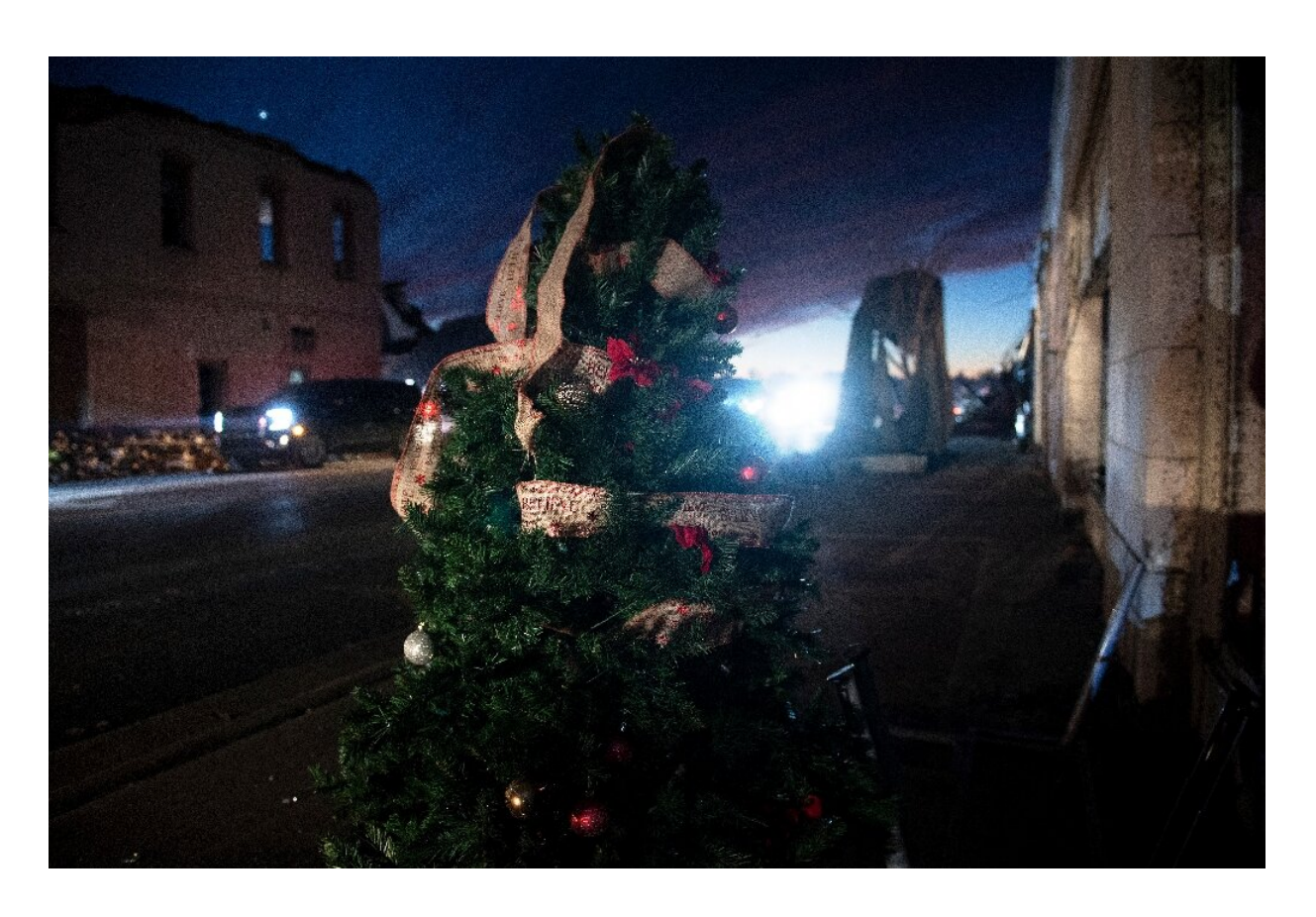
A Christmas tree stands by a road amid the damage in Mayfield.