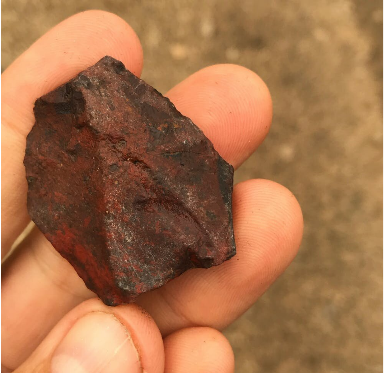
Serengeti spearpoint.

Curiously, the oldest evidence for regular fire use comes from Europe—then inhabited by Neanderthals. Did Neanderthals master fire first? Why not? Their brains were as big as ours ; they used them for something, and living through Europe's ice-age winters, Neanderthals needed fire more than African Homo sapiens.