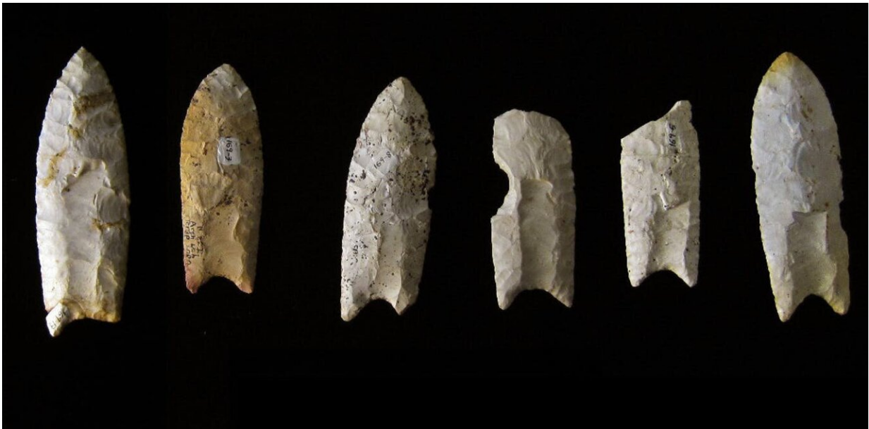
Clovis spearheads.

For the first few million years of human evolution, technologies changed slowly. Some three million years ago, our ancestors were making chipped stone flakes and crude choppers . Two million years ago, hand-axes . A million years ago, primitive humans sometimes used fire , but with difficulty. Then, 500,000 years ago, technological change accelerated, as spearpoints, firemaking, axes, beads and bows appeared.