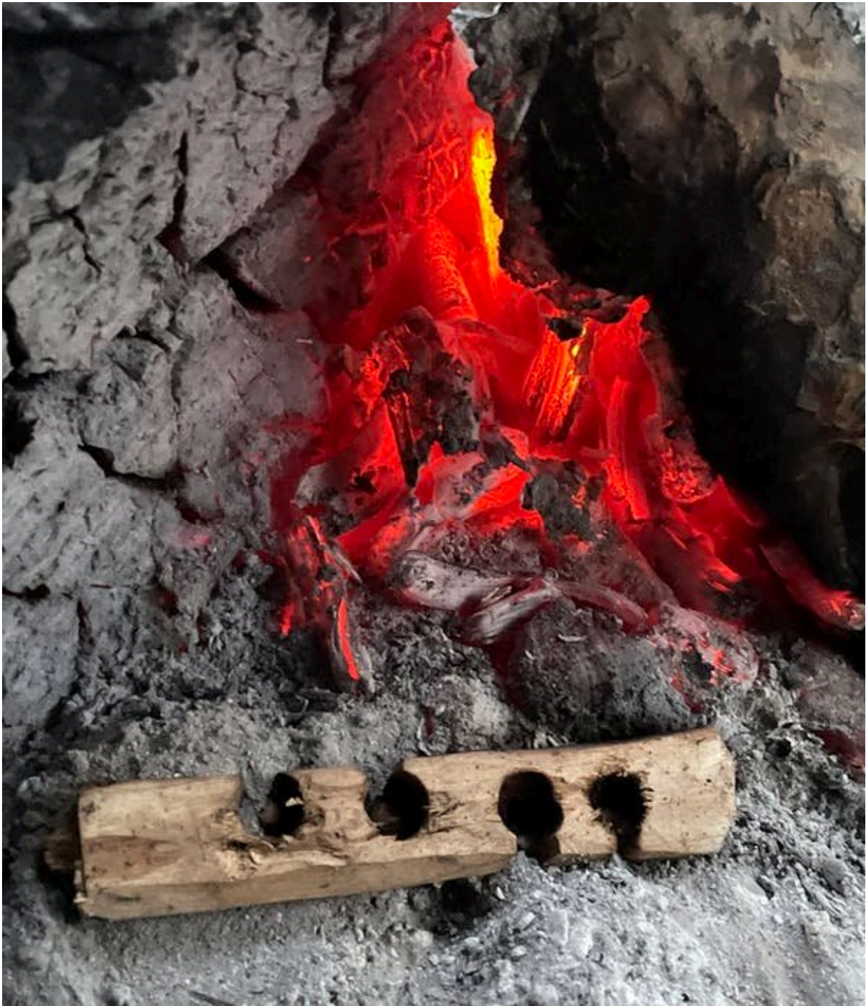
Hadzabe fire drill.