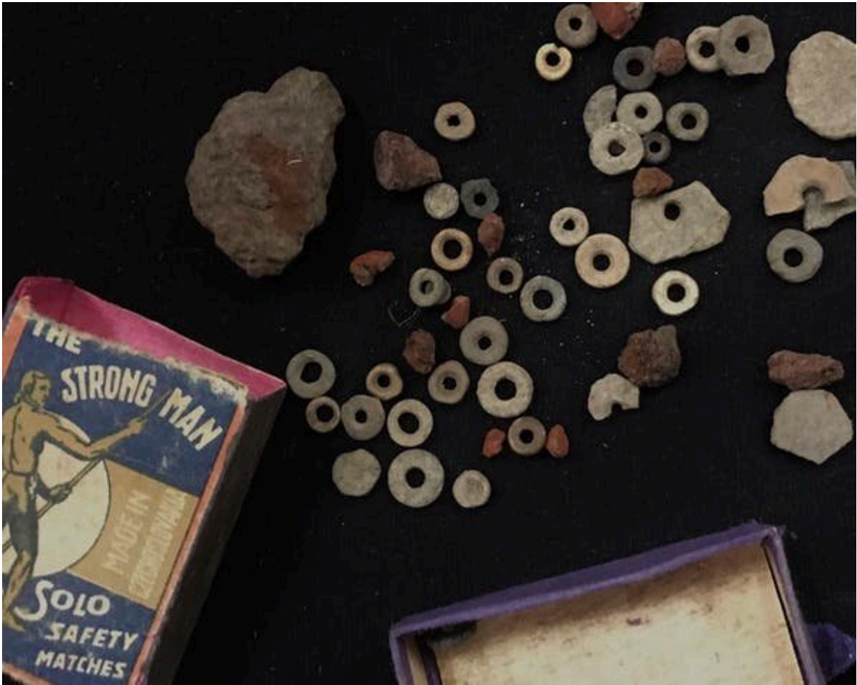
Kondoa beads.

Conflict could have driven exchange, with people stealing or capturing tools and weapons. Native Americans, for example, got horses by capturing them from the Spanish . But it's likely that people often just traded technologies, simply because it was safer and easier. Even today, modern hunter-gatherers, who lack money, still trade—Hadzabe hunters exchange honey for iron arrowheads made by neighboring tribes, for example.