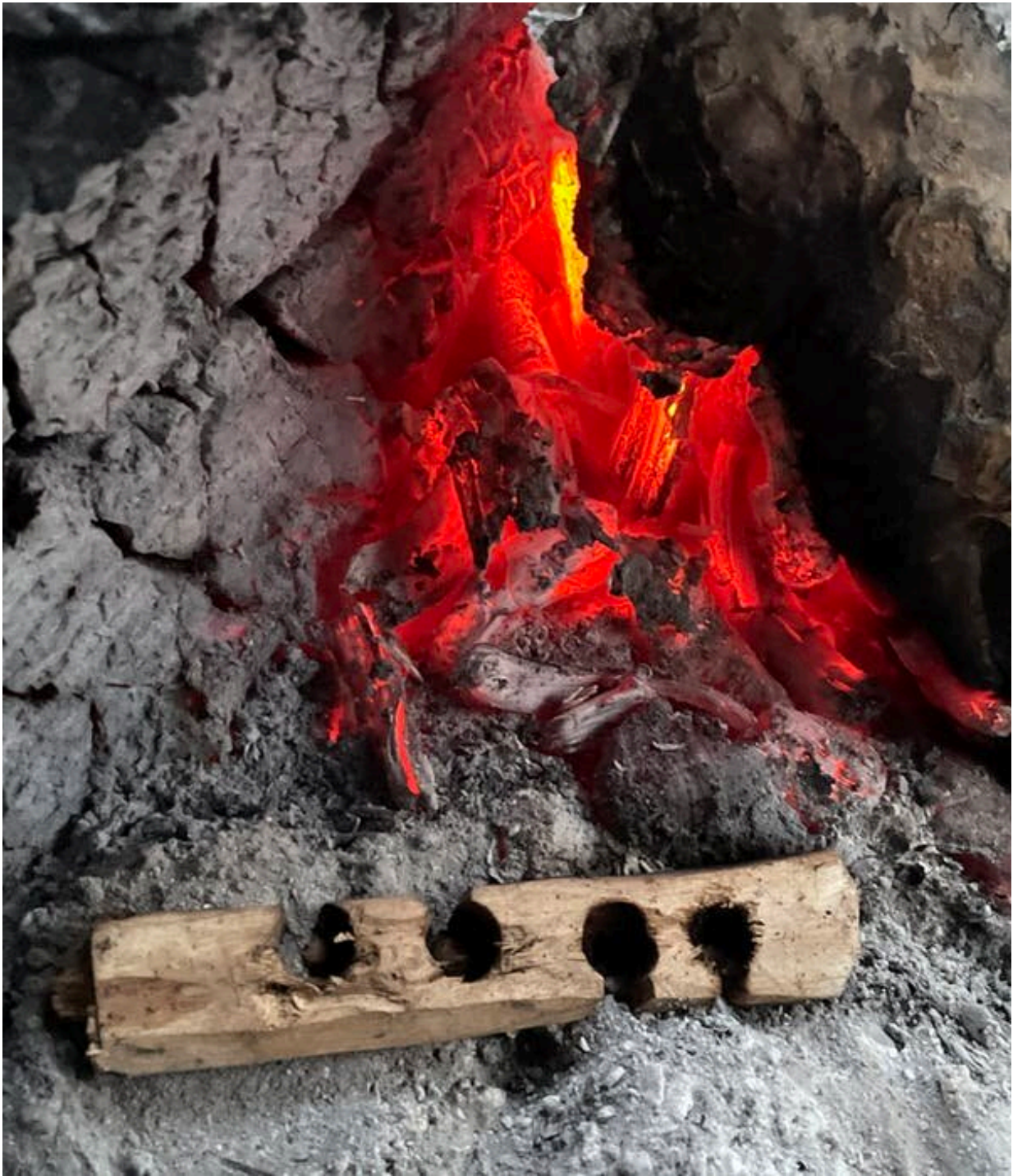
Hadzabe fire drill.