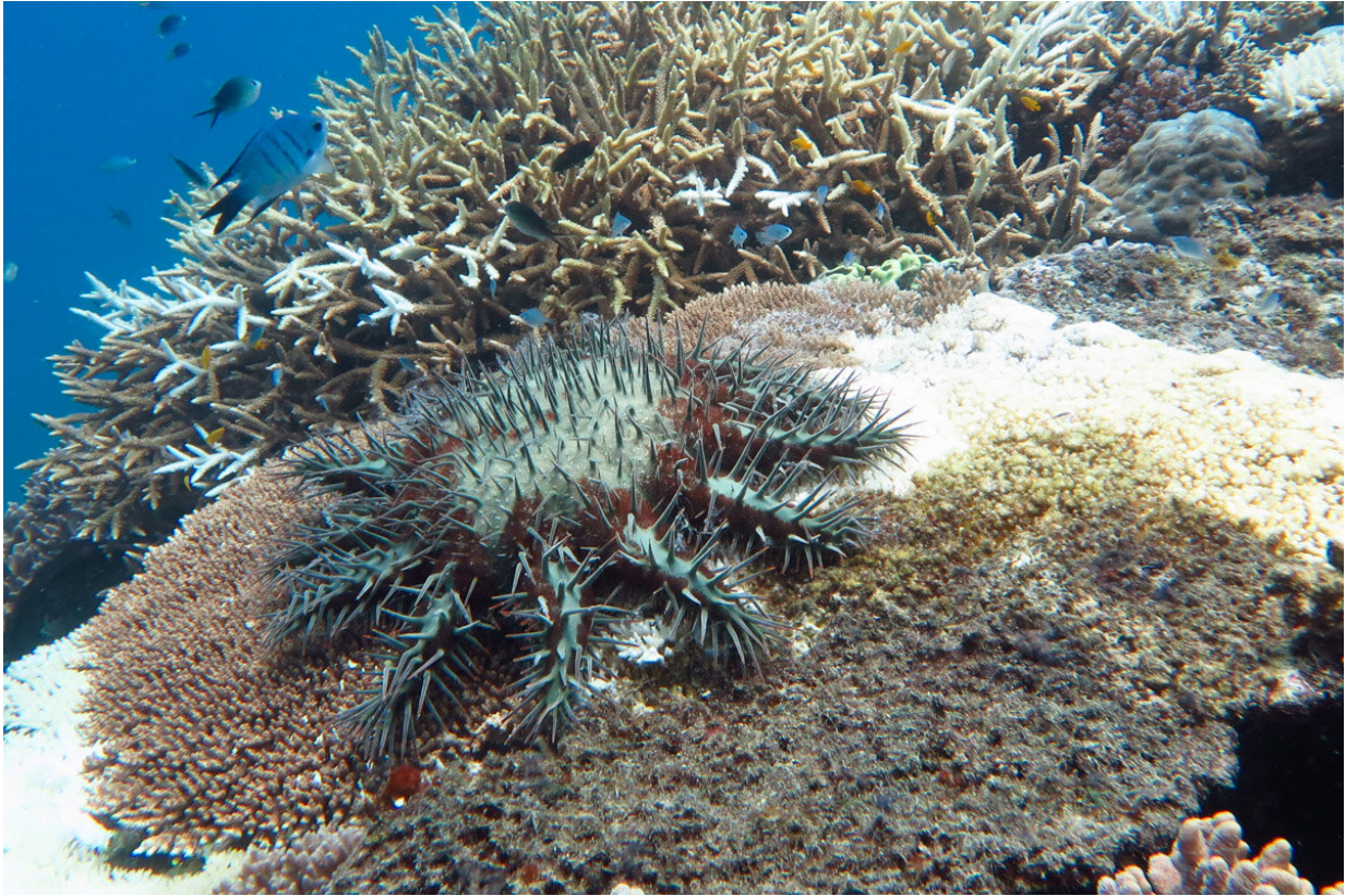
A crown-of-thorns starfish feeding on a plate coral on the Great Barrier Reef.

The findings have provided an opportunity to investigate new tools for controlling outbreaks on the Great Barrier Reef and perhaps across the Indo-Pacific, such as targeted fisheries-based management.