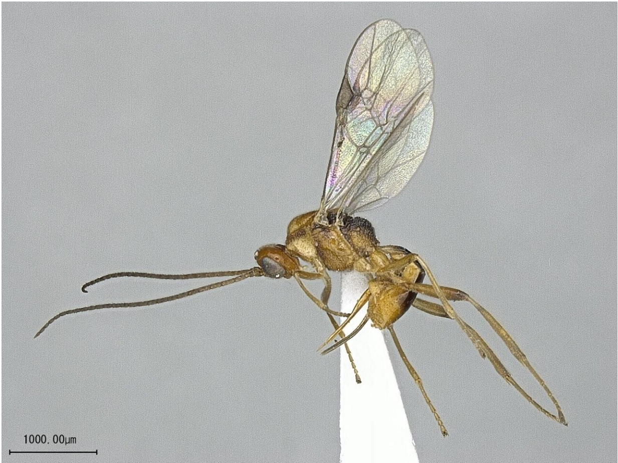
The new parasitoid wasps, Meteorus stellatus .