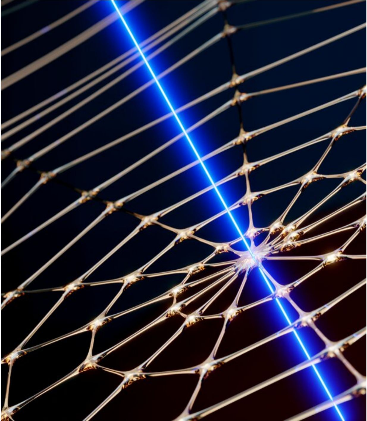
Artist impression of an artificial spider web probed with laser light.