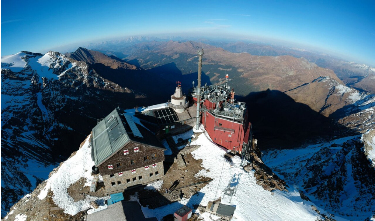
Sonnblick Observatory in the Austrian Alps.