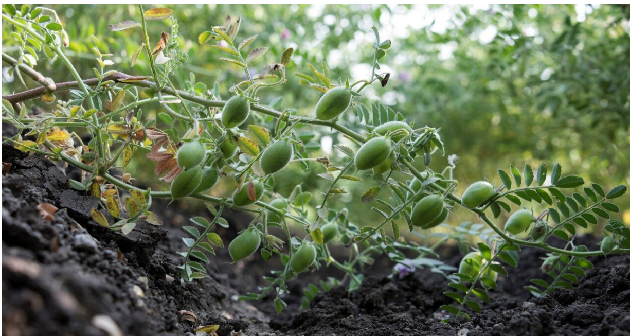
A chickpea plant with its pods when seen up-close.

"We examined 129 varieties released in the past. Though a few superior haplotypes were detected in some of these varieties, we found that most varieties lacked many beneficial haplotypes. We have arrived at 56 promising lines that can bring these haplotypes into breeding programs to develop enhanced varieties," explained study author Dr. Manish Roorkiwal, a Senior Scientist in Genomics and Molecular Breeding at ICRISAT.