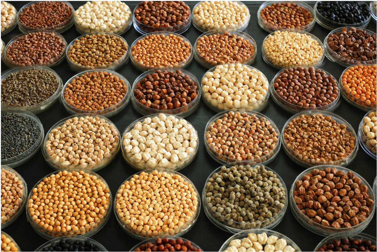
The genetic diversity of chickpea seen through seeds.

A larger endeavor to sequence more lines began soon after as the need to completely understand the genetic variation at species level, including in landraces and wild types, became apparent. In the latest research, the study's authors report sequencing 3,171 cultivated accessions and 195 wild accessions of chickpea that are conserved in multiple genebanks. These 3,366 accessions are representative of chickpea's genetic diversity in a much larger global collection.