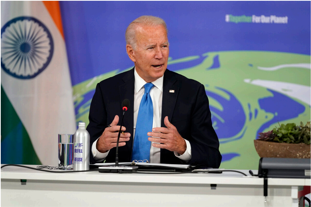
President Joe Biden speaks during a meeting on the "Build Back Better World" initiative at the COP26 U.N. Climate Summit, Tuesday, Nov. 2, 2021, in Glasgow, Scotland.