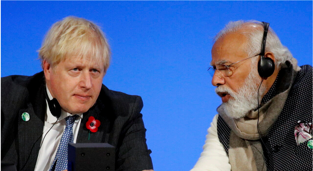
Britain's Prime Minister Boris Johnson, left, and India's Prime Minister Narendra Modi attend a meeting during the UN Climate Change Conference COP26 in Glasgow, Scotland, Tuesday, Nov. 2, 2021.