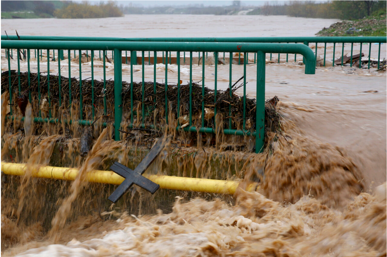
A wooden cross brought by overflowing river is stuck in the railing of a bridge in Butmir near Sarajevo, Bosnia, Friday, Nov. 5, 2021. Heavy rain has caused flash flooding in Bosnia, prompting evacuations and submerging local roads in some parts of the country on Friday.