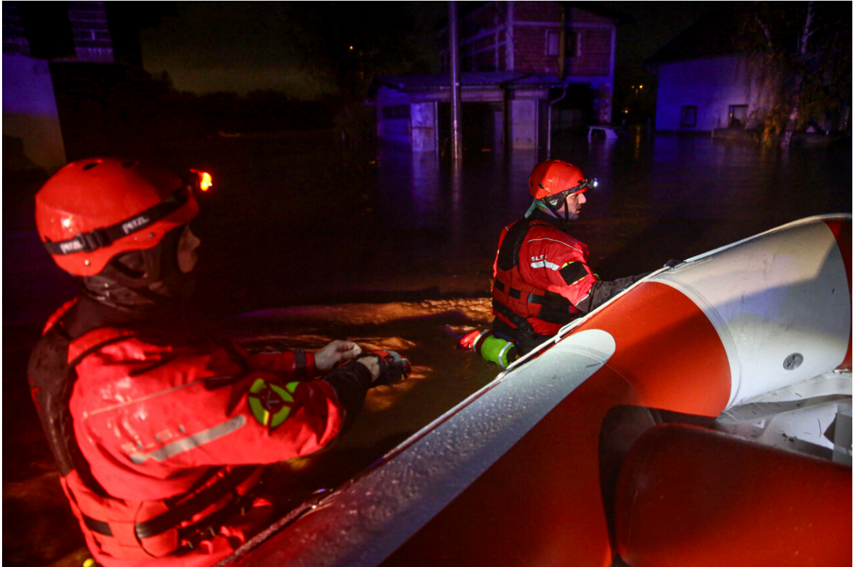
Rescuers from Bosnia's mountain rescue services drag a boat while looking for people to be rescued from their homes in the village of Ahatovici, near Sarajevo, Bosnia, Friday, Nov. 5, 2021. Heavy rain has caused flash flooding in Bosnia, prompting evacuations and submerging local roads in some parts of the country on Friday.