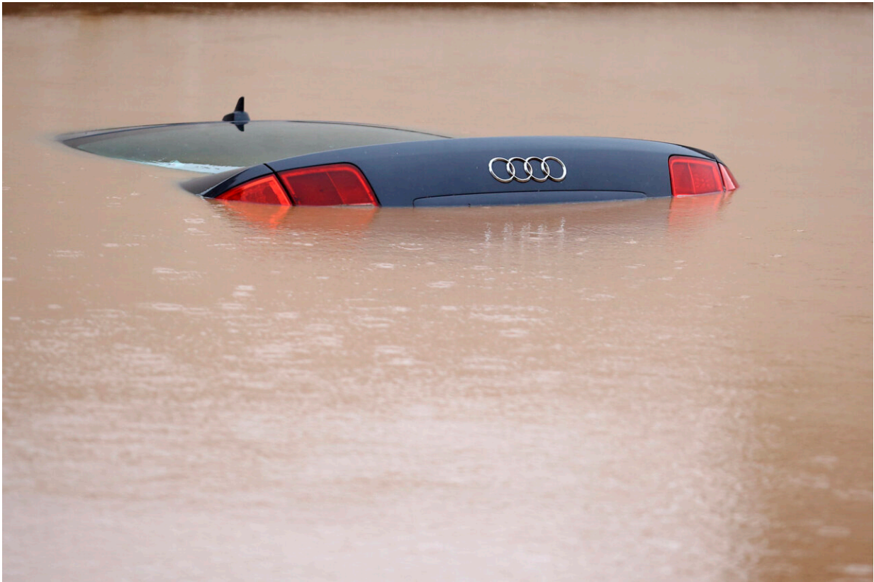
A car is submerged in a flooded street in the Sarajevo suburb of Ilidza, Bosnia, Friday, Nov. 5, 2021. Heavy rain has caused flash flooding in Bosnia, prompting evacuations and submerging local roads in some parts of the country on Friday.