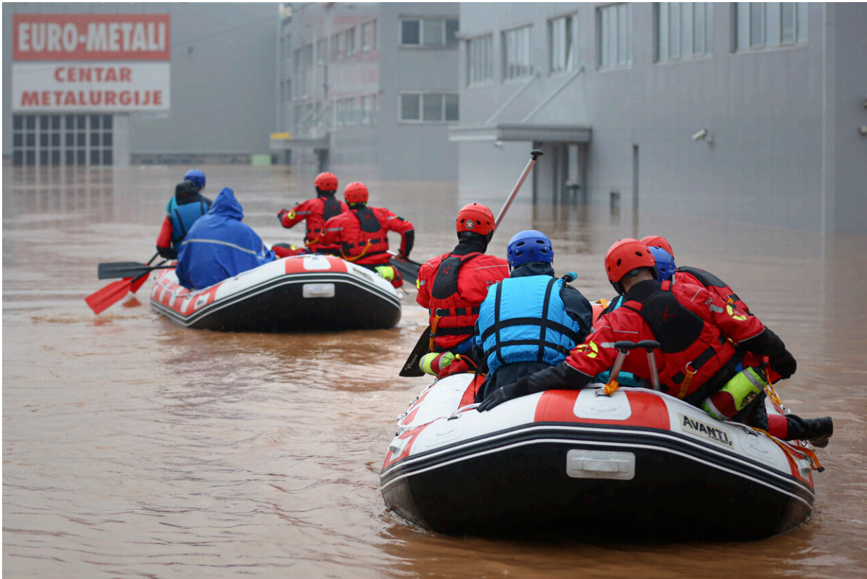
Rescuers from Bosnia's mountain rescue evacuate residents from their flooded homes in the village of Rajlovac, near Sarajevo, Bosnia, Friday, Nov. 5, 2021. Heavy rain has caused flash flooding in Bosnia, prompting evacuations and submerging local roads in some parts of the country on Friday.