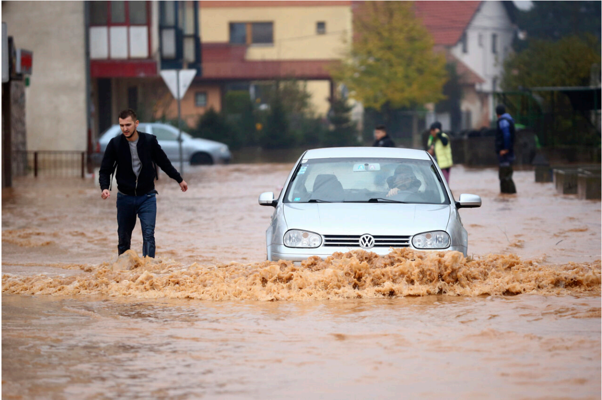
A man wades through a flooded street as a car drives by in the Sarajevo suburb of Ilidza, Bosnia, Friday, Nov. 5, 2021. Heavy rain has caused flash flooding in Bosnia, prompting evacuations and submerging local roads in some parts of the country on Friday.