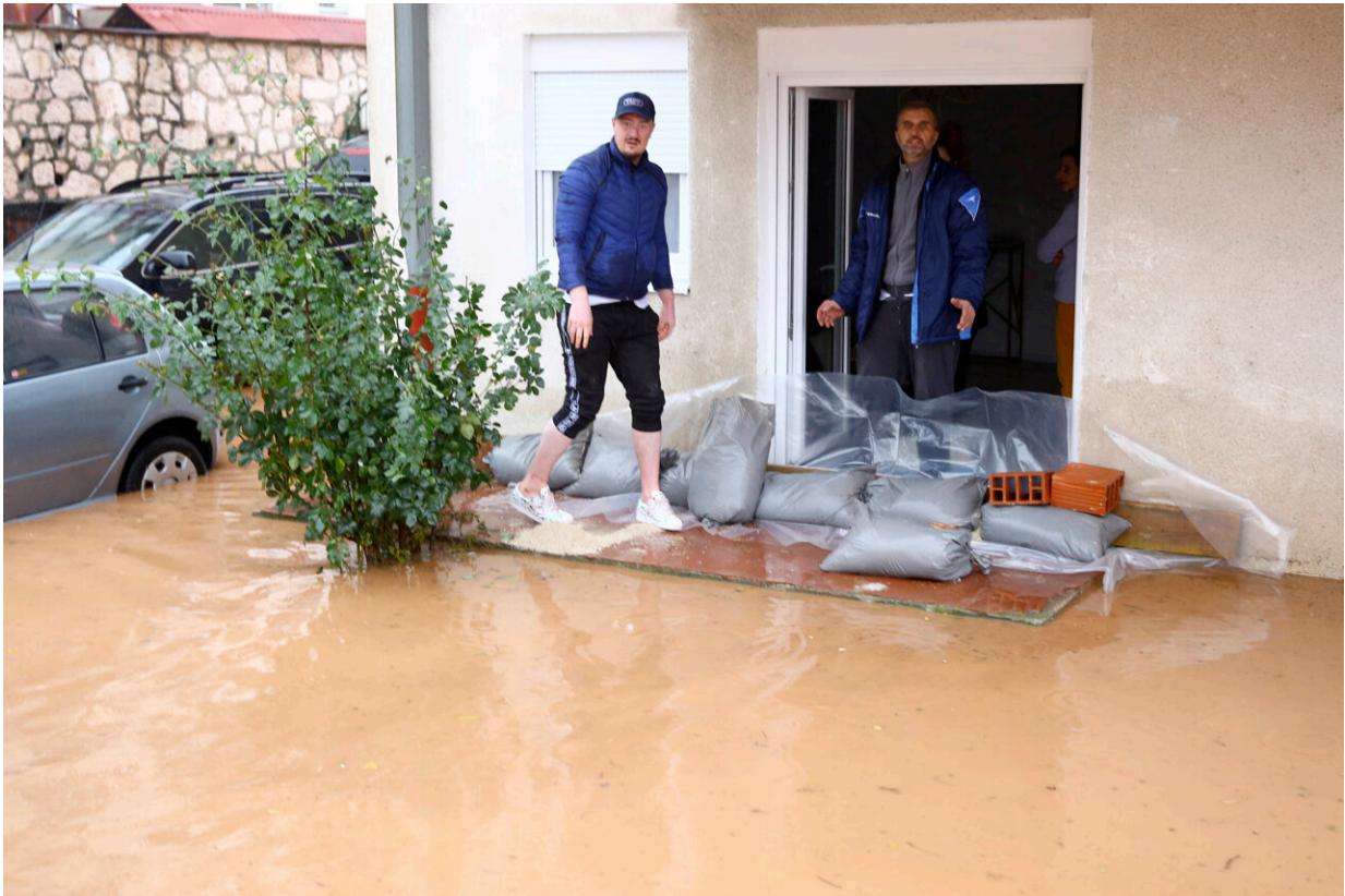
Men protect a house on a flooded street in the Sarajevo suburb of Ilidza, Bosnia, Friday, Nov. 5, 2021. Heavy rain has caused flash flooding in Bosnia, prompting evacuations and submerging local roads in some parts of the country on Friday.