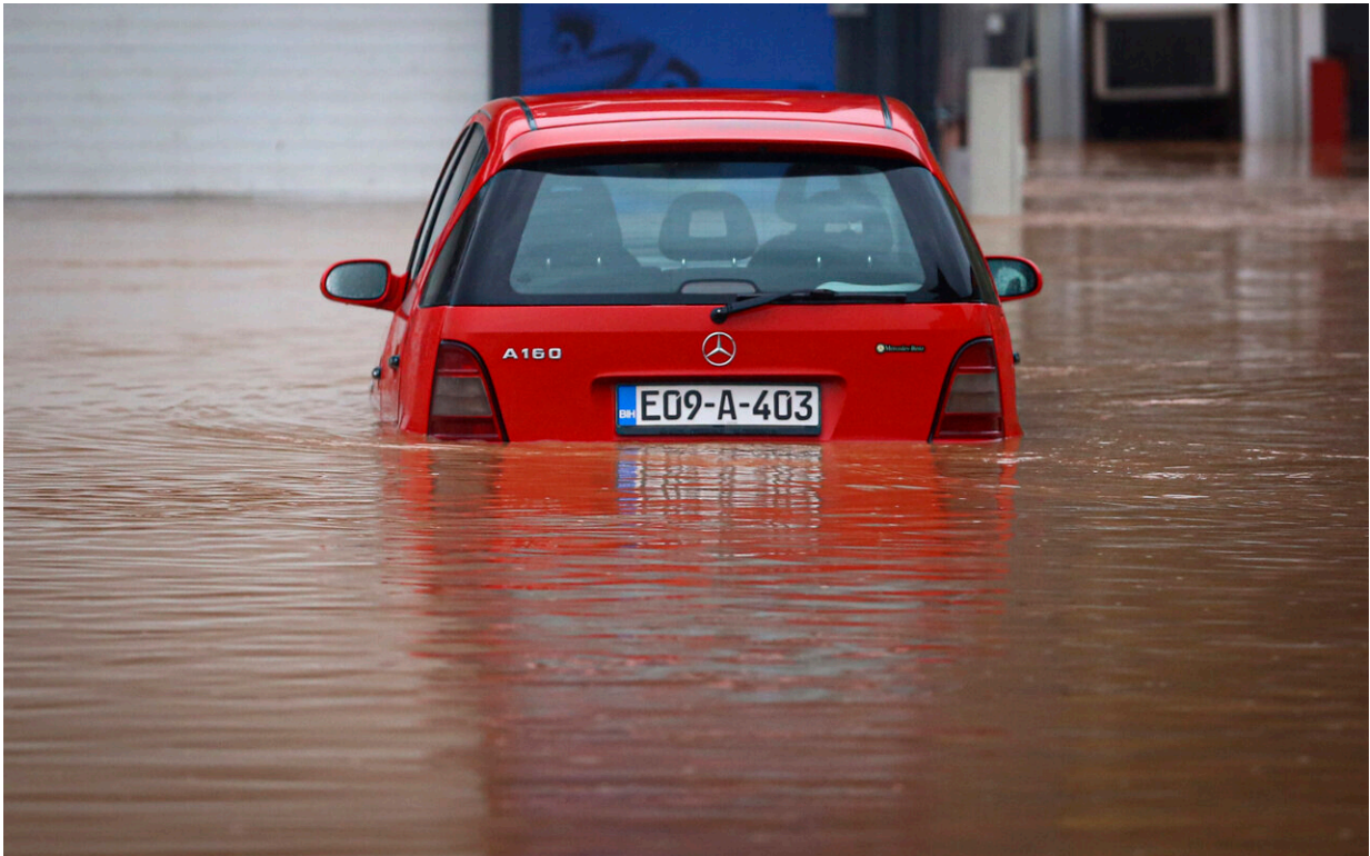
A vehicle is partially submerged in the flooded village of Rajlovac, near Sarajevo, Bosnia, Friday, Nov. 5, 2021. Heavy rain has caused flash flooding in Bosnia, prompting evacuations and submerging local roads in some parts of the country on Friday.