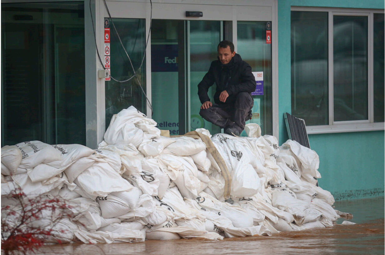
A man sits on sandbags in the flooded village of Rajlovac, near Sarajevo, Bosnia, Friday, Nov. 5, 2021. Heavy rain has caused flash flooding in Bosnia, prompting evacuations and submerging local roads in some parts of the country on Friday.