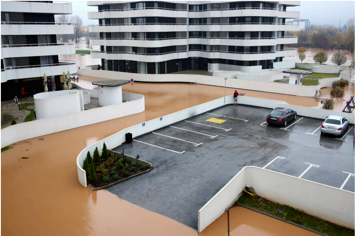
Parts of residential areas are submerged in high water in the Sarajevo suburb of Ilidza, Bosnia, Friday, Nov. 5, 2021. Heavy rain has caused flash flooding in Bosnia, prompting evacuations and submerging local roads in some parts of the country on Friday.