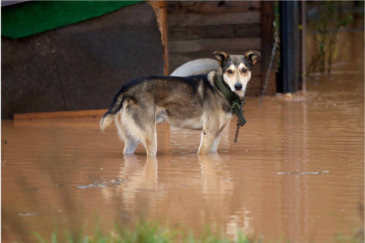
A dog stands in a flooded yard in the Sarajevo suburb of Ilidza, Bosnia, Friday, Nov. 5, 2021. Heavy rain has caused flash flooding in Bosnia, prompting evacuations and submerging local roads in some parts of the country on Friday.