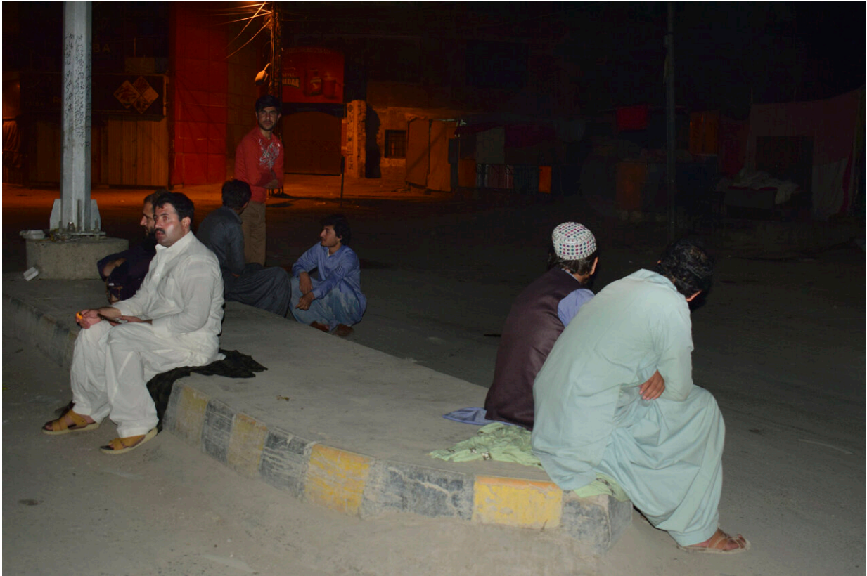
Local residents gather outside their houses following a severe earthquake is felt the area, in Quetta, Pakistan, Thursday, Oct. 7, 2021. A powerful earthquake collapsed at least one coal mine and dozens of mud houses in southwest Pakistan early Thursday.