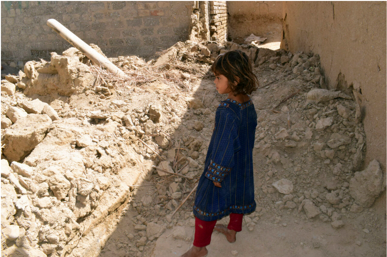
A girl looks at a damaged house following an earthquake in Harnai, about 100 kilometers (60 miles) east of Quetta, Pakistan, Thursday, Oct. 7, 2021. The powerful earthquake collapsed at least one coal mine and dozens of mud houses in southwest Pakistan early Thursday.