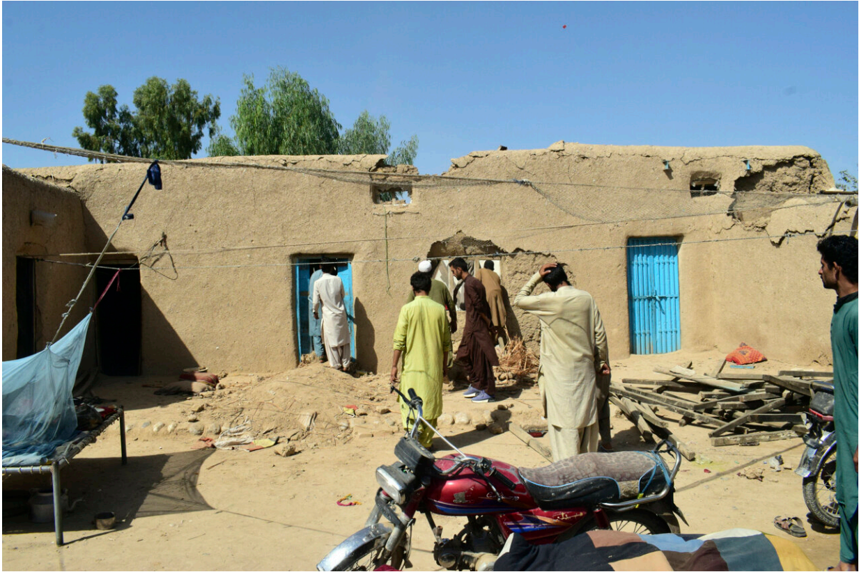
Members of a family take belongings following an earthquake in Harnai, about 100 kilometers (60 miles) east of Quetta, Pakistan, Thursday, Oct. 7, 2021. The powerful earthquake collapsed at least one coal mine and dozens of mud houses in southwest Pakistan early Thursday.