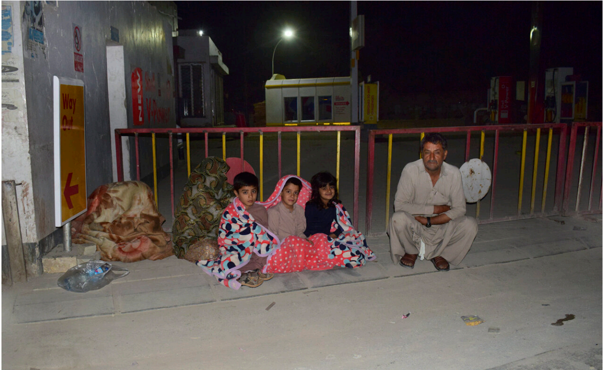
A family gather outside their house following a severe earthquake hit the area, in Quetta, Pakistan, Thursday, Oct. 7, 2021. A powerful earthquake shook parts of southwestern Pakistan early Thursday.