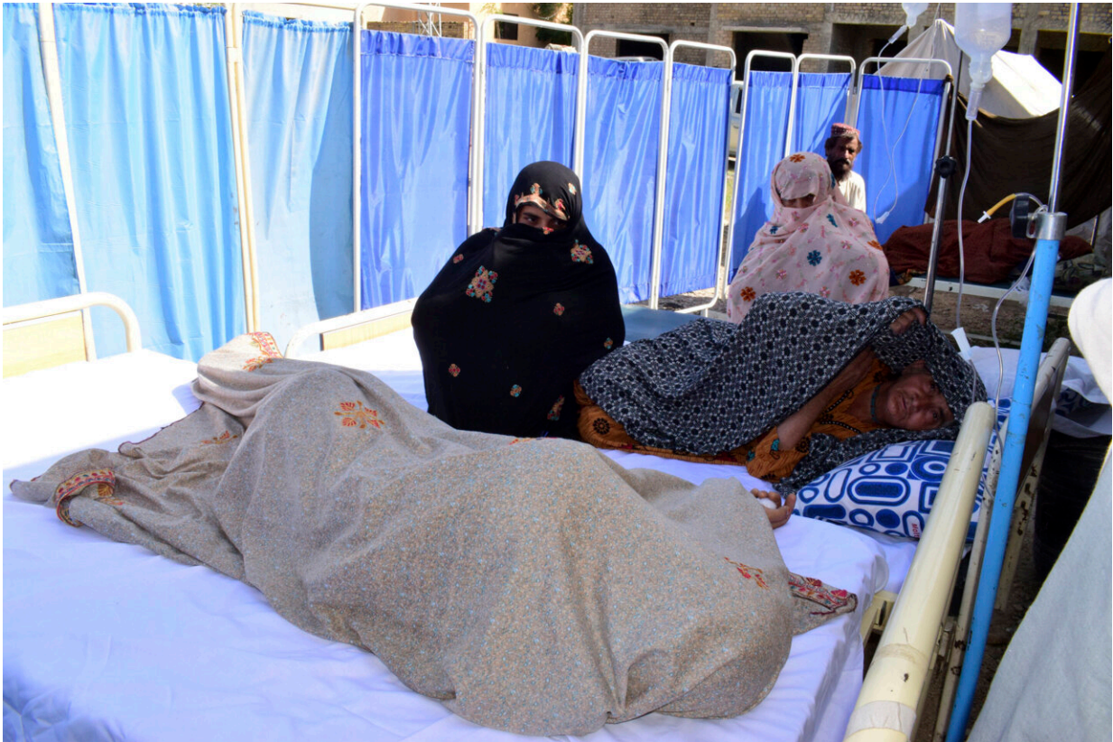
Injured women receive treatment at a local hospital following an earthquake in Harnai, about 100 kilometers (60 miles) east of Quetta, Pakistan, Thursday, Oct. 7, 2021. The powerful earthquake collapsed at least one coal mine and dozens of mud houses in southwest Pakistan early Thursday.