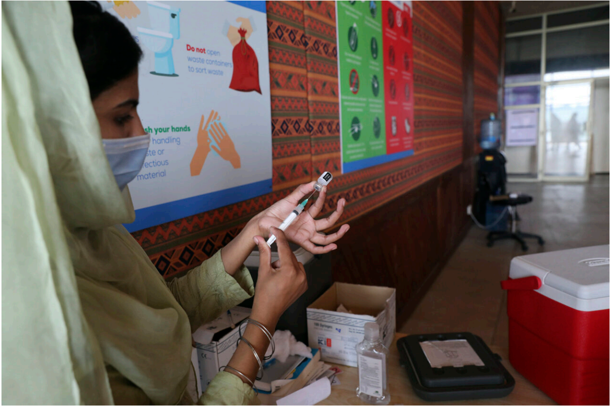
A health worker prepares the Pfizer COVID-19 vaccine at a vaccination center in Islamabad, Pakistan, Monday, Oct. 4, 2021.