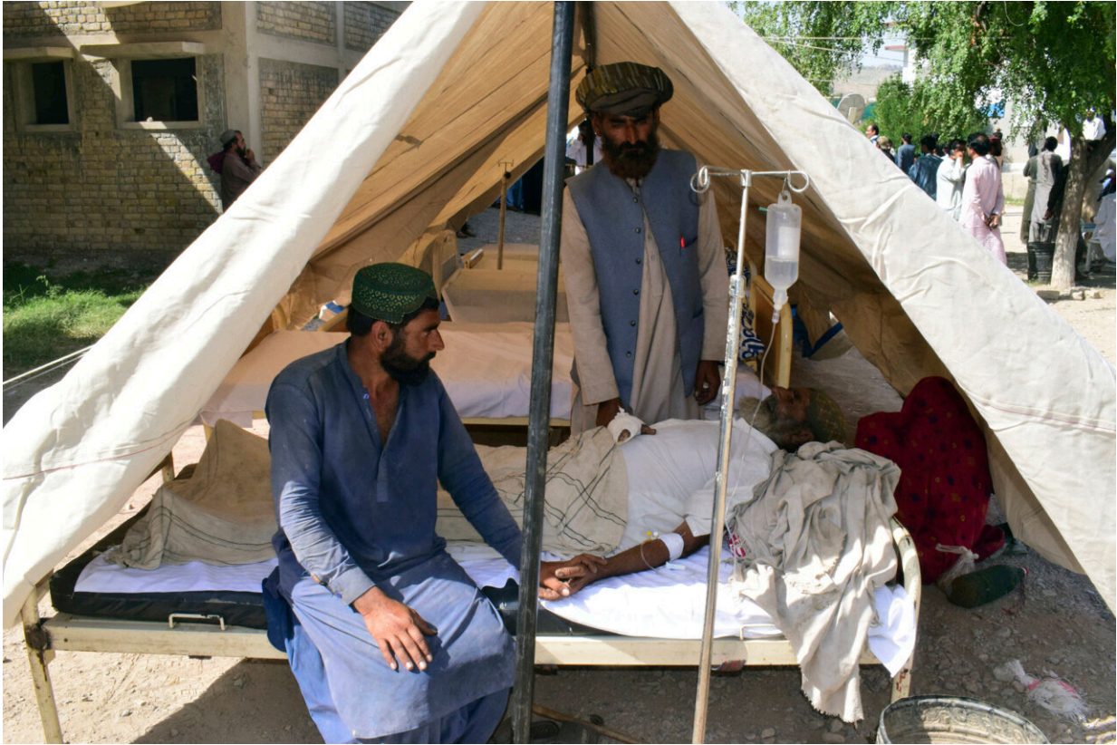
An injured men receives treatment in a tent set up at a local hospital following an earthquake in Harnai, about 100 kilometers (60 miles) east of Quetta, Pakistan, Thursday, Oct. 7, 2021. The powerful earthquake collapsed at least one coal mine and dozens of mud houses in southwest Pakistan early Thursday.