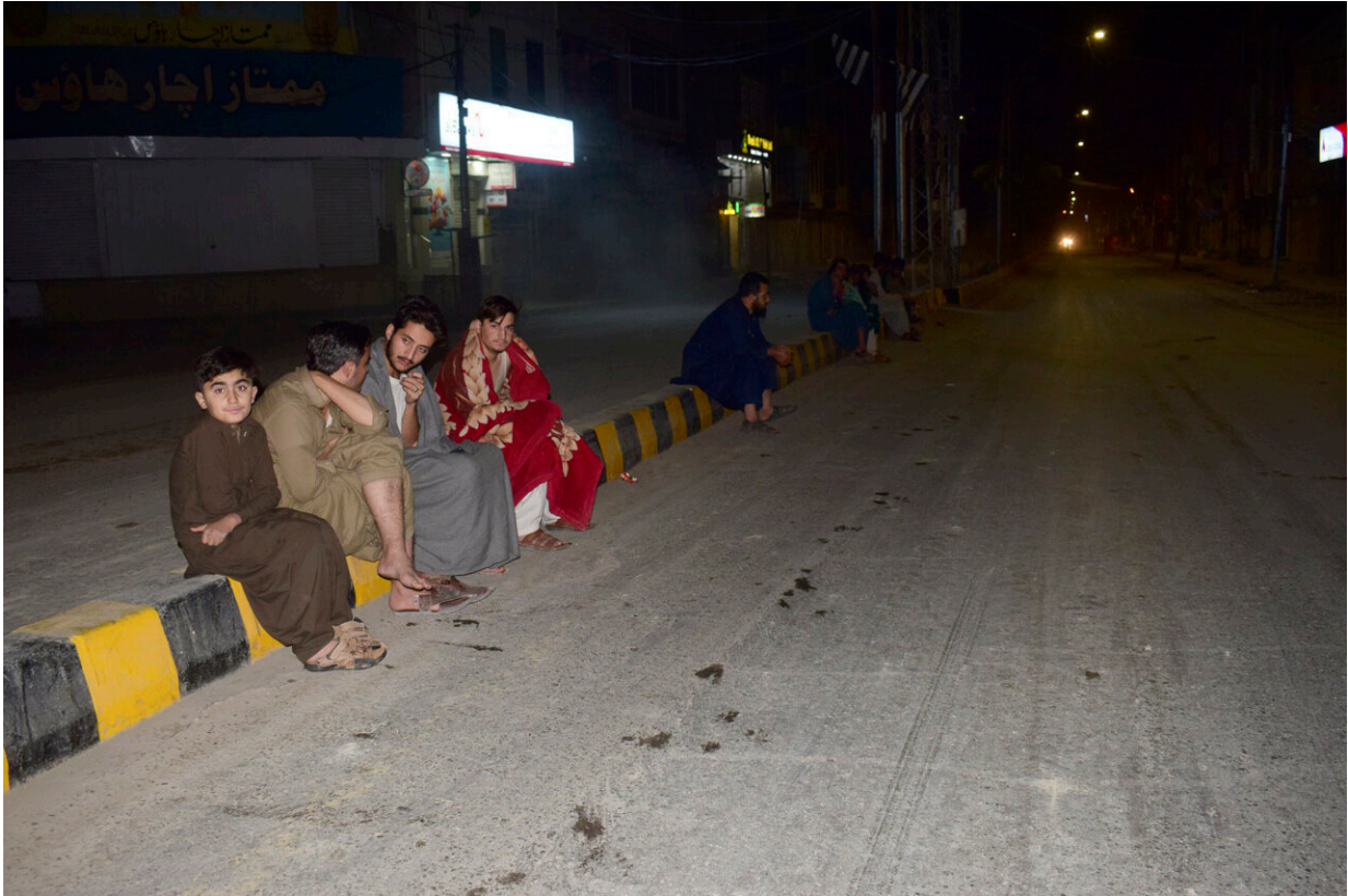
Local residents gather outside their houses following a severe earthquake hit the area, in Quetta, Pakistan, Thursday, Oct. 7, 2021. A powerful earthquake shook parts of southwestern Pakistan early Thursday.