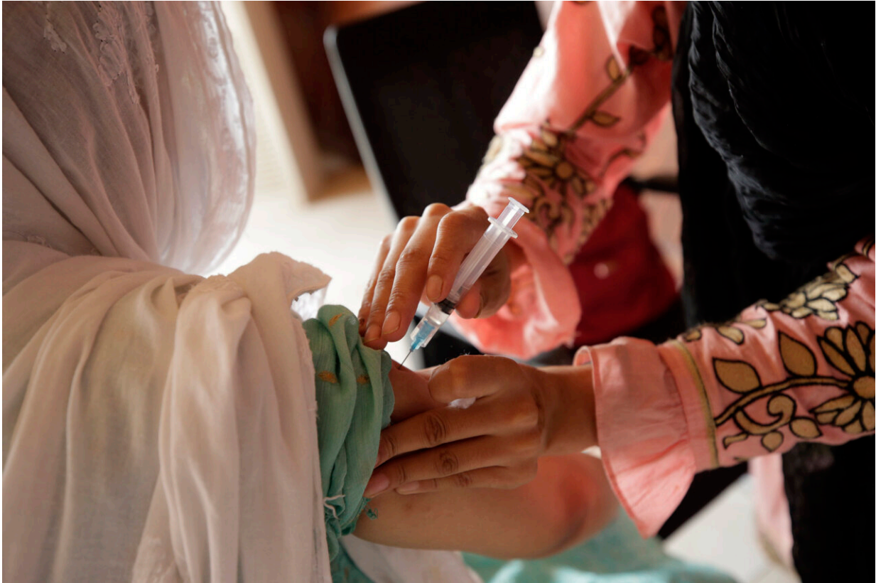
A woman receives the Sinopharm COVID-19 vaccine from a health worker at a vaccination center in Islamabad, Pakistan, Monday, Oct. 4, 2021.