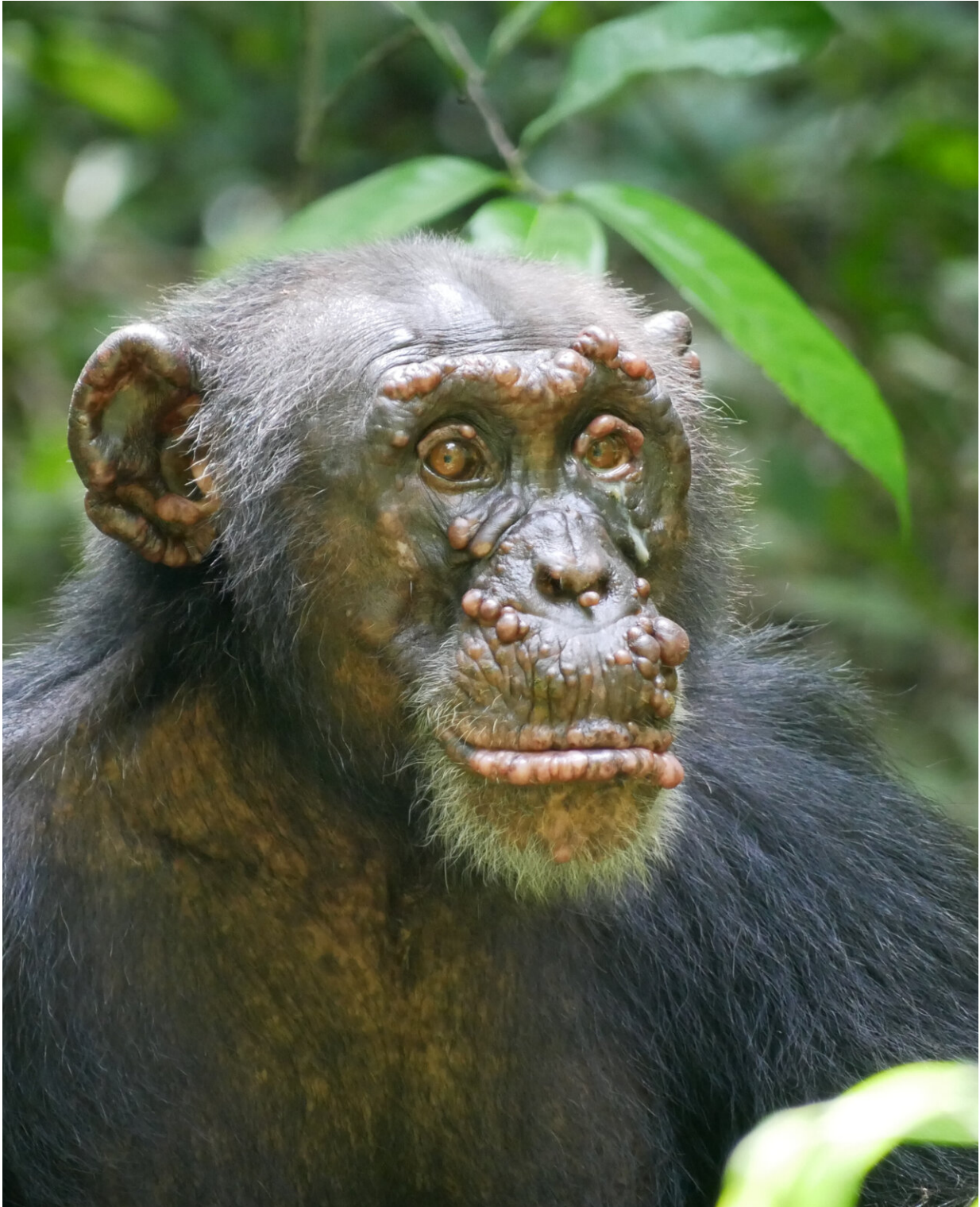
A chimpanzee named Woodstock with leprosy in Ivory Coast.