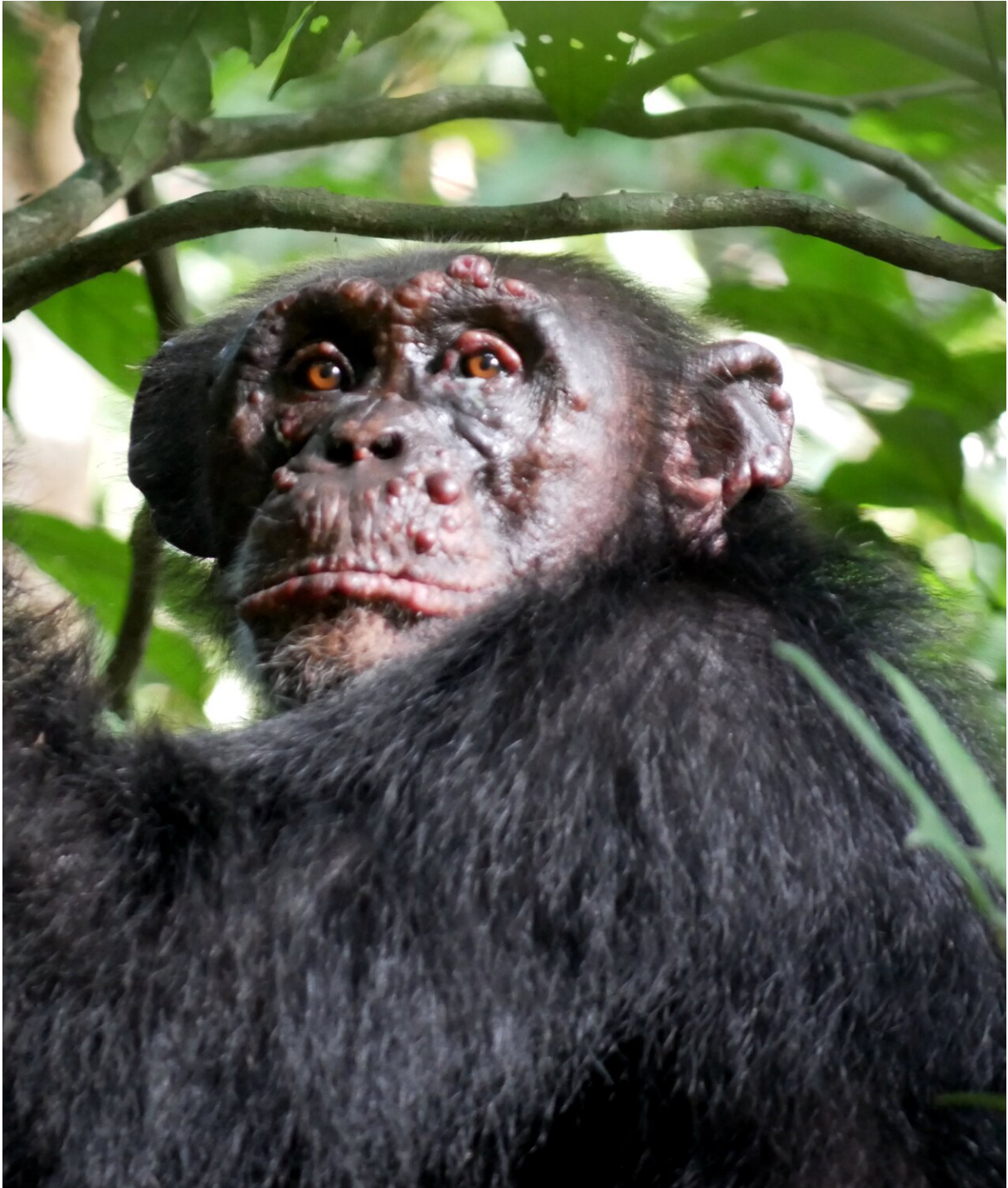
A chimpanzee named Woodstock with leprosy in Ivory Coast.