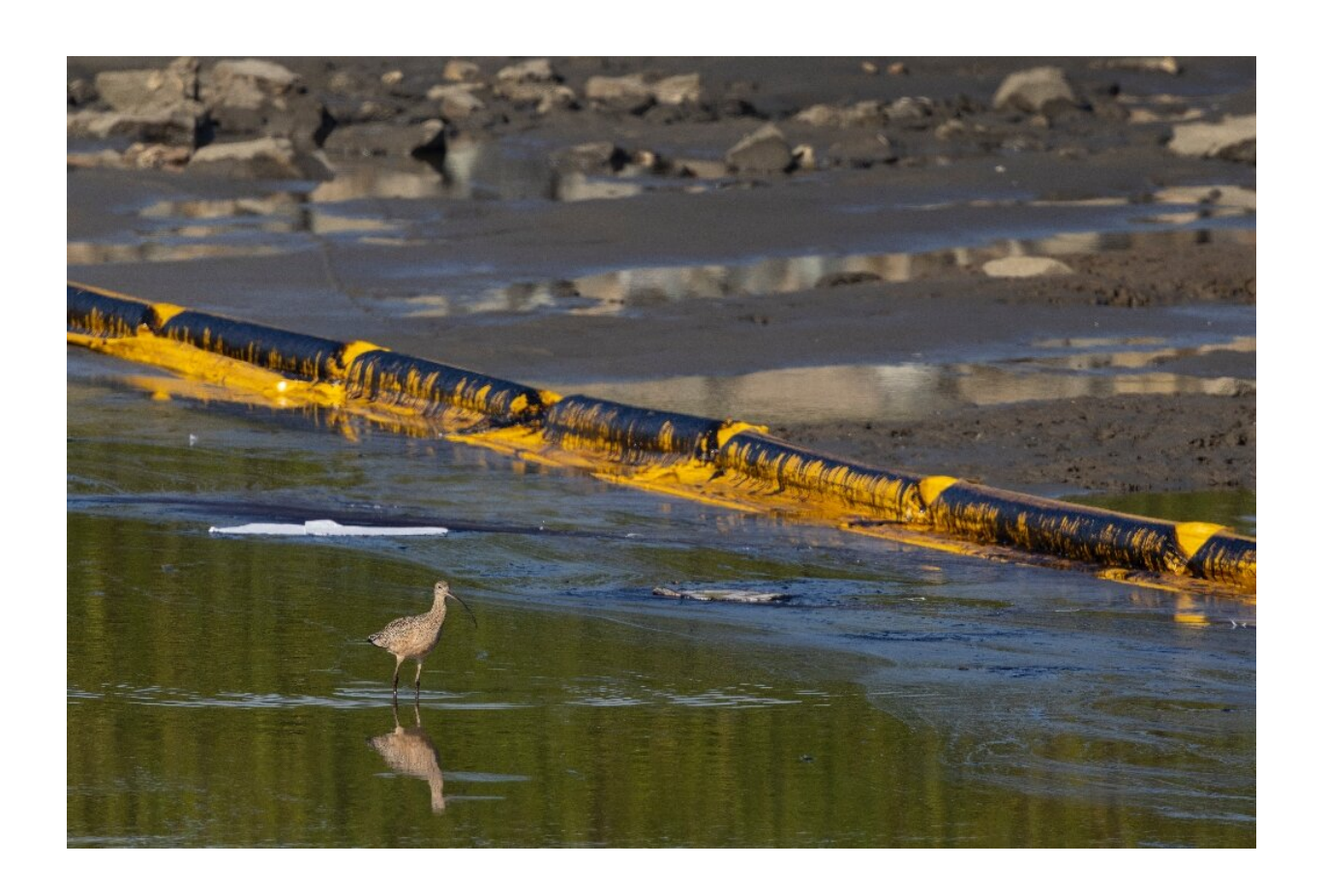
The 126,000-gallon oil spill has already started to affect wildlife.

A huge oil spill was killing wildlife and threatening California's beaches on Monday, in what officials said amounted to an "environmental catastrophe."