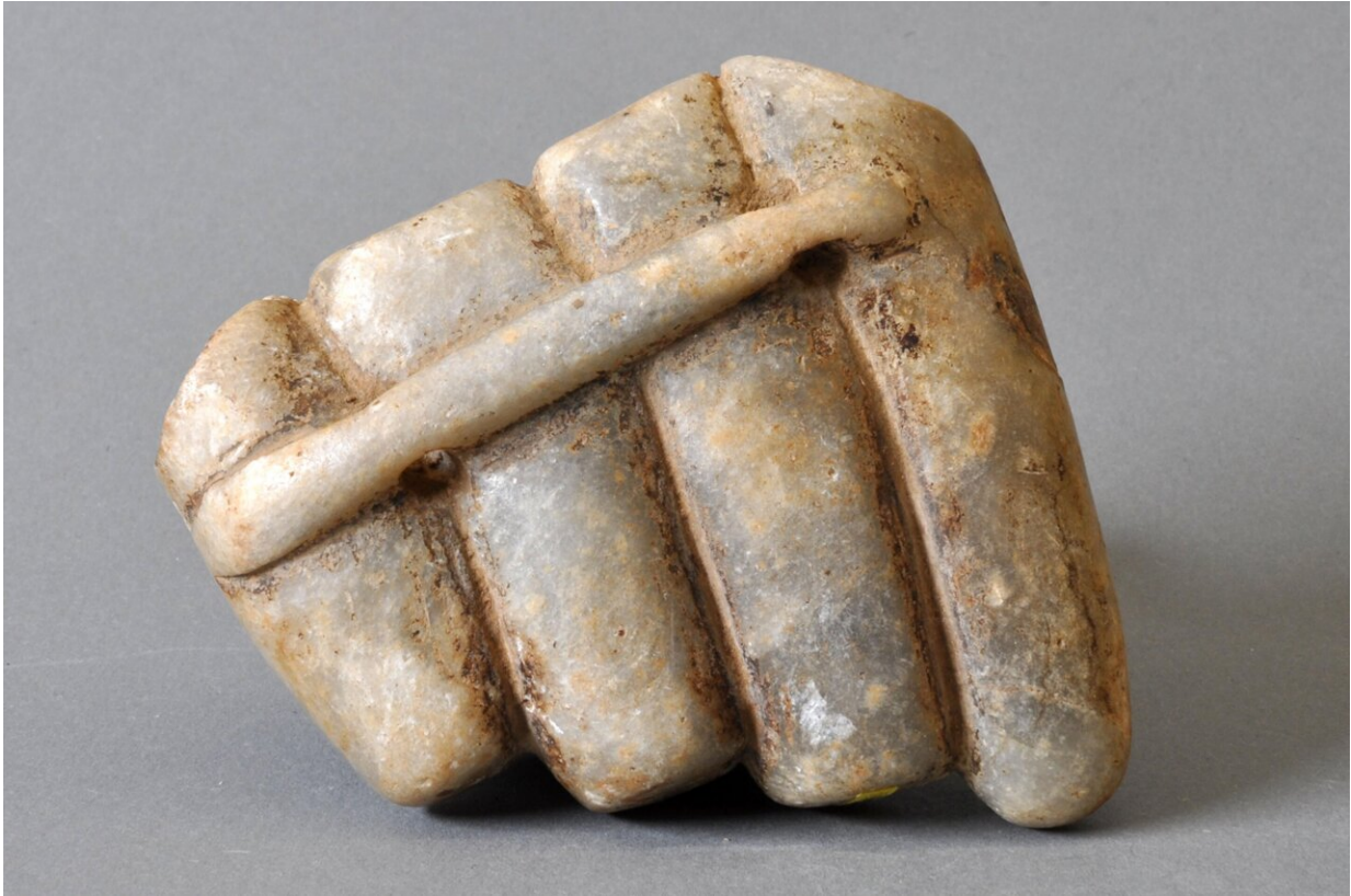
Panpipe made of marble, Chavín Culture of the northern coast of Peru.