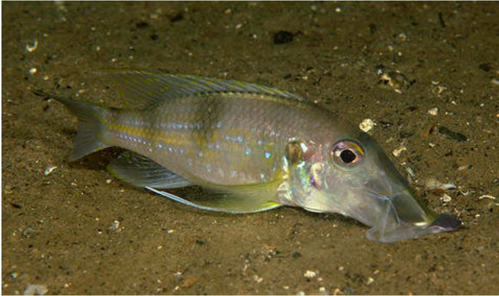
One of Lake Malawi's many cichlids.