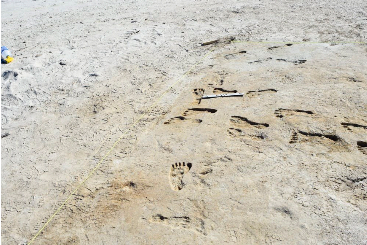
On the left, modern shoeprints; on the right, footprints millennia old.