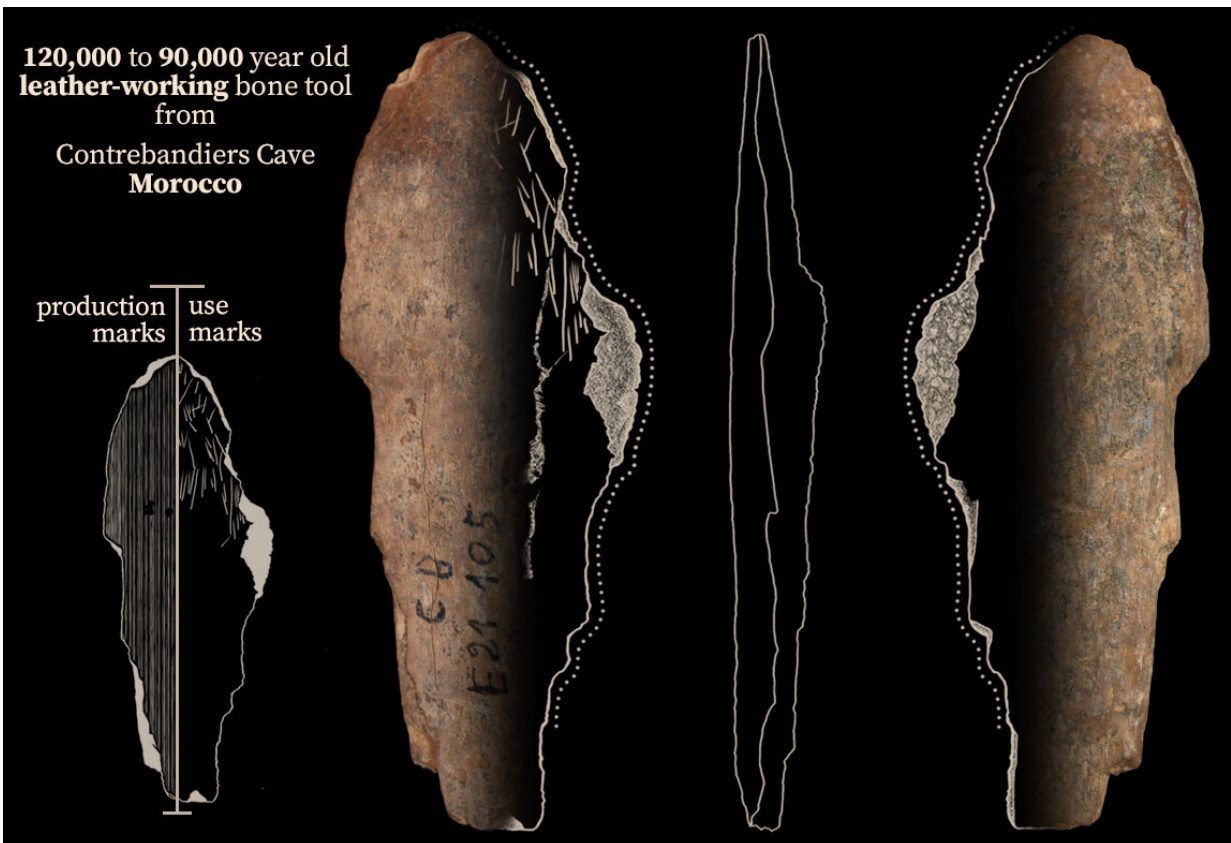
A bone tool from Contrebandiers Cave, Morocco that was used for leather working 120,000 to 90,000 years ago.

"The combination of carnivore bones with skinning marks and bone tools likely used for fur processing provide highly suggestive proxy evidence for the earliest clothing in the archaeological record," says Hallett, "but given the level of specialization in this assemblage, these tools are likely part of a larger tradition with earlier examples that haven't yet been found."