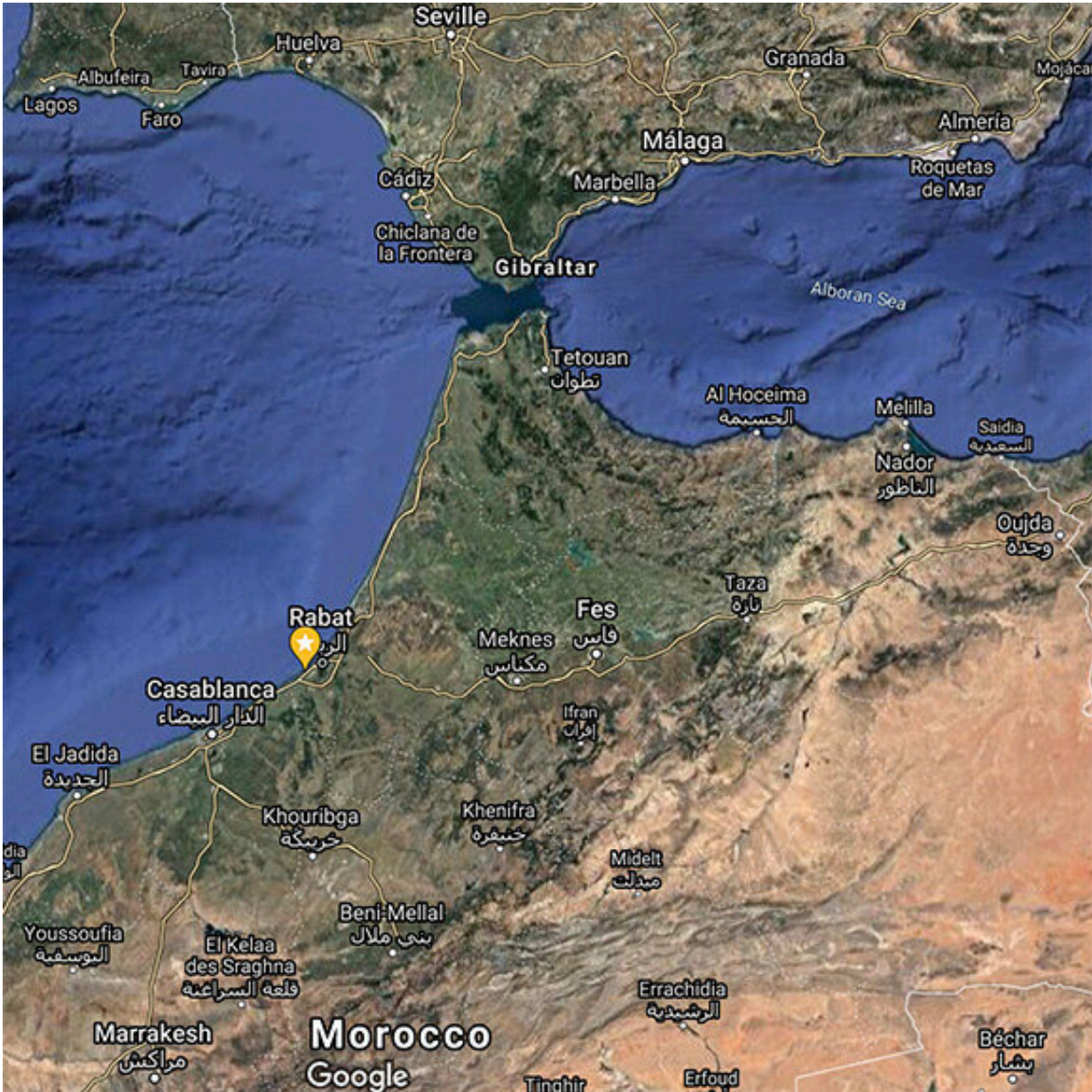
Contrabandiers Cave, Morocco, location along the coastline.

Also hidden amongst the bone fragments was the tip of a tooth from a whale or dolphin bearing marks consistent with use as a pressure flaker—a tool used for shaping stone tools. Given the age of the find,