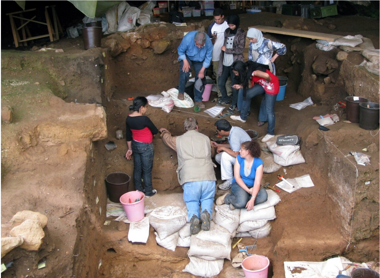
Excavation at Contrebandiers Cave, Morocco.