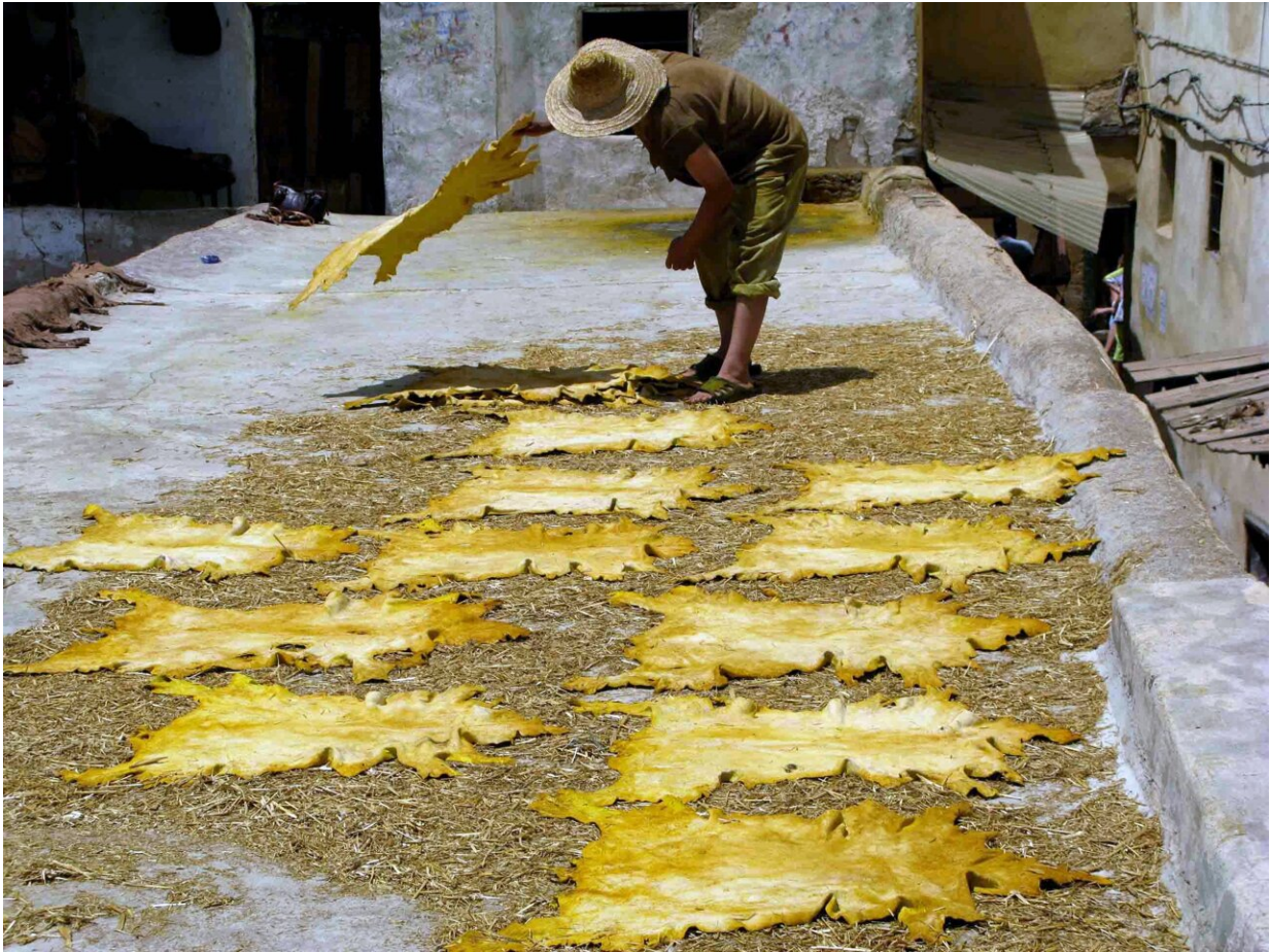
Hides drying in the sun at Chouara Tannery in Fez, Morocco.

Among the roughly 12,000 bone fragments , Hallett found more than 60 animal bones that had been shaped by humans for use as tools. At the same time, Hallett identified a pattern of cut marks on the carnivore bones suggesting that, rather than processing them for meat, the occupants of Contrabandiers Cave were skinning them for fur.