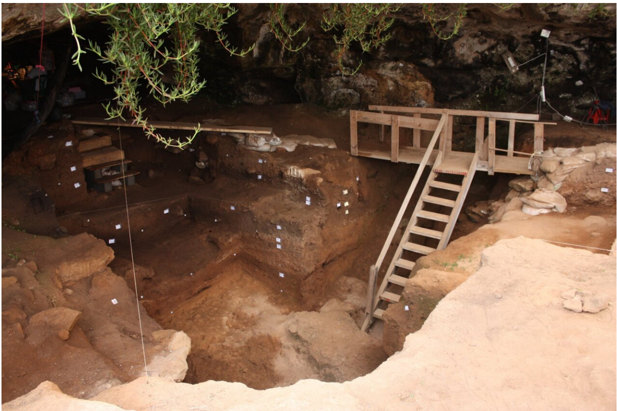
Entrance to Contrebandiers Cave, Morocco.

"Once again, we see that complex technologies such as bone tools are only associated with aquatic adaptations at the origin point of modern humans," noted Marean. "The coast was crucial."