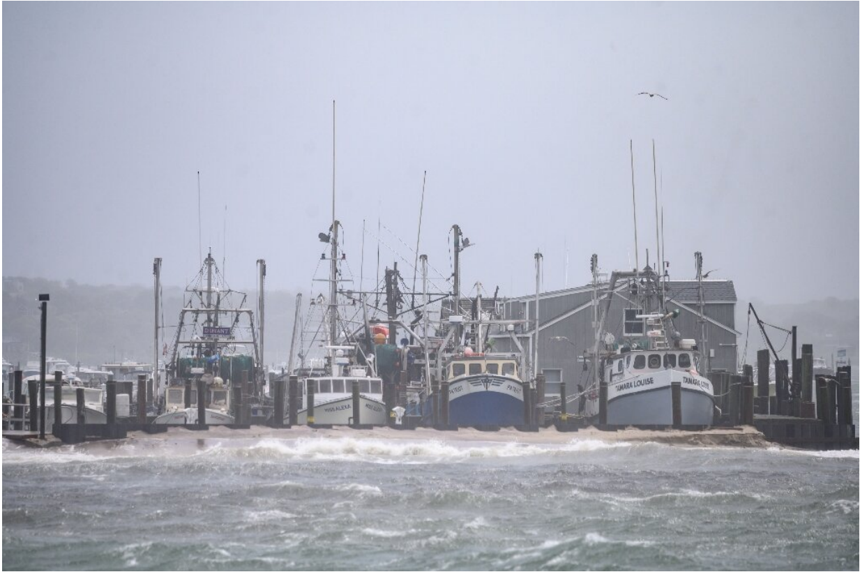
A general view shows boats in Montauk harbour as Tropical Storm Henri passes Long Island on August 22, 2021.