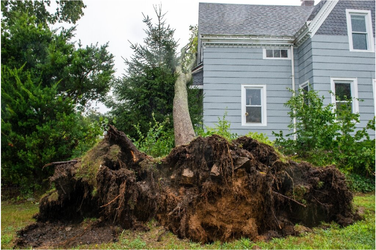
A tree uprooted by Tropical Storm Henri in New London, Connecticut on August 22, 2021.