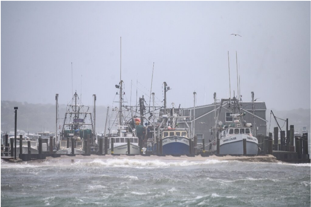
A general view shows boats in Montauk harbour as Tropical Storm Henri passes Long Island on August 22, 2021.