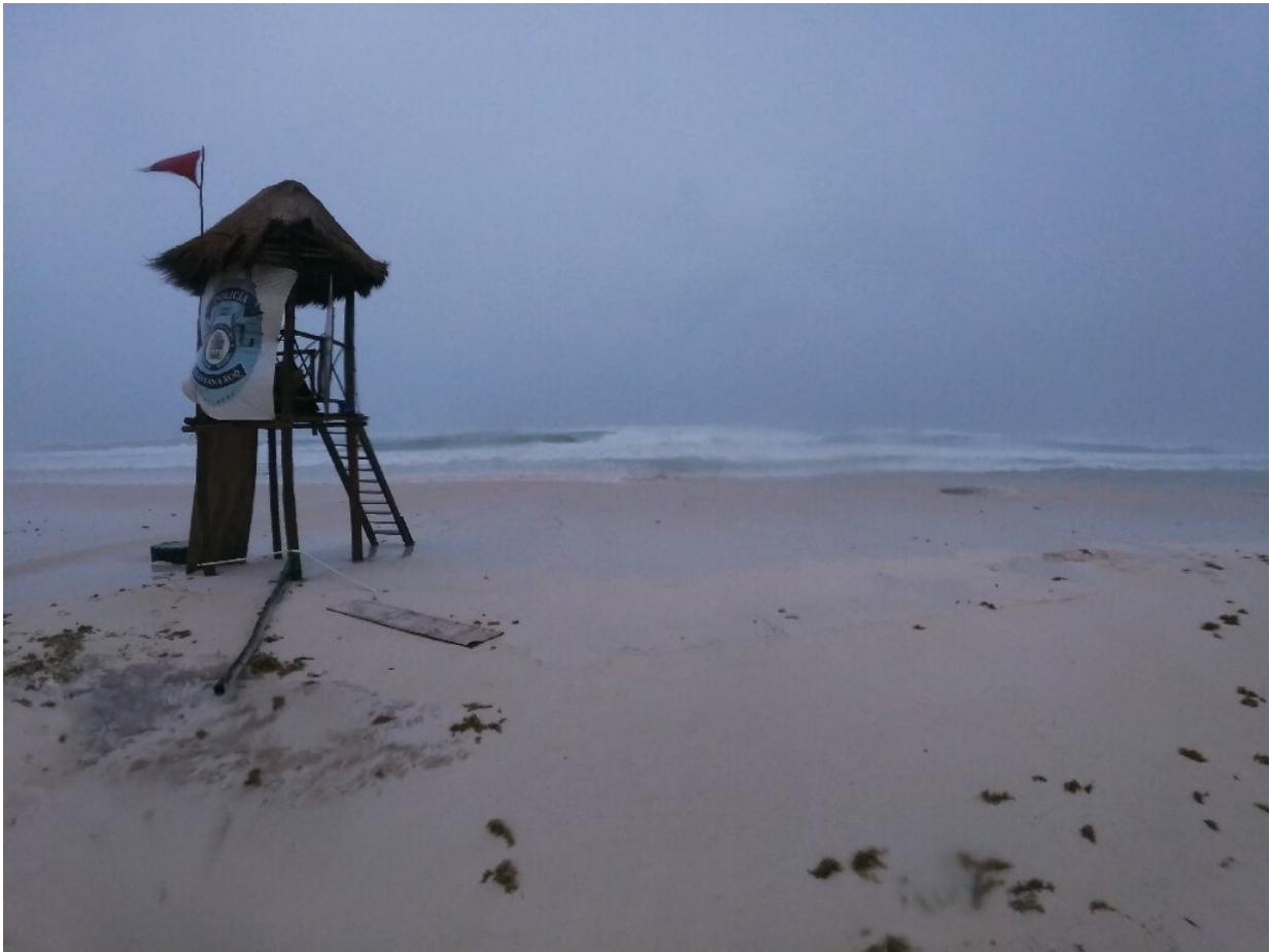
Hurricane Grace buffets the coast of Cancun, Mexico on August 19, 2021.