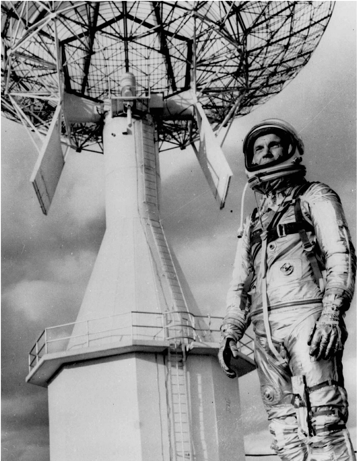
In this June 18, 1963, file photo, astronaut John Glenn, the first American to