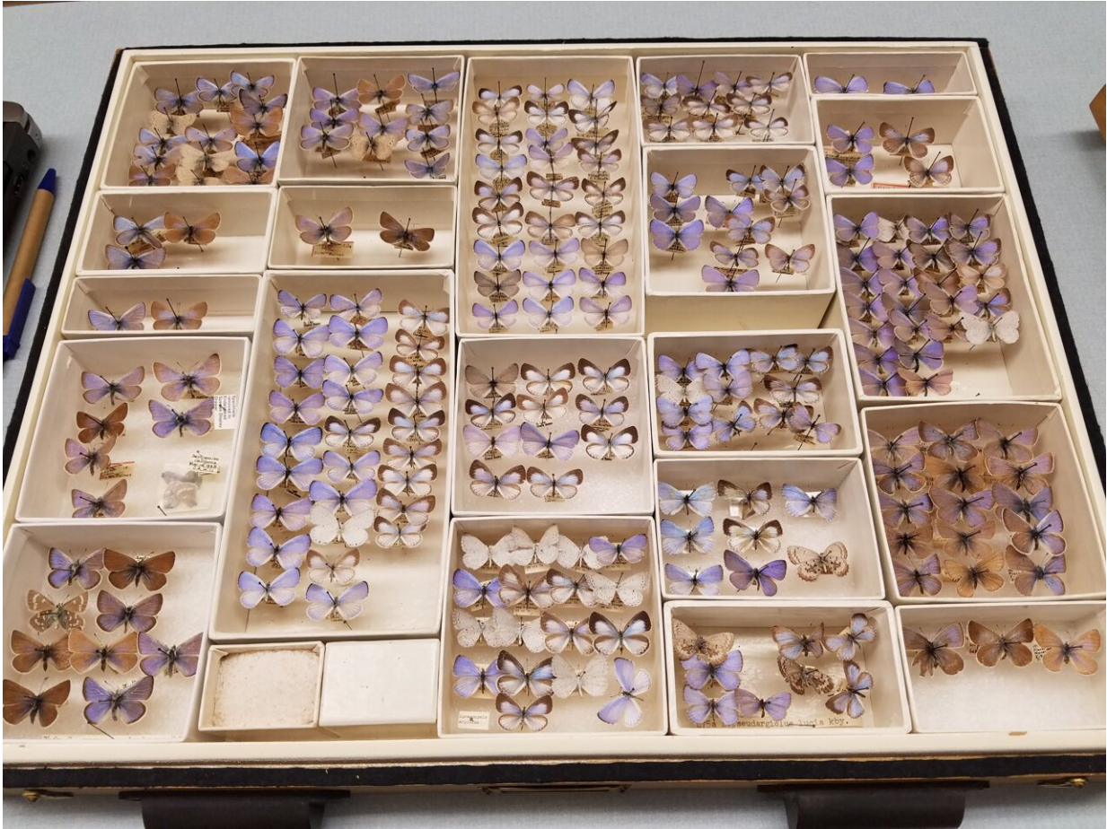
A collections drawer of extinct Xerces blue butterflies.

DNA analysis of extinct species sometimes invites questions of bringing the species back, à la Jurassic Park, but Grewe and Moreau note in their paper that those efforts could be better spent protecting species that still exist. "Before we start putting a lot of effort into resurrection, let's put that effort into protecting what's there and learn from our past mistakes," says Grewe.