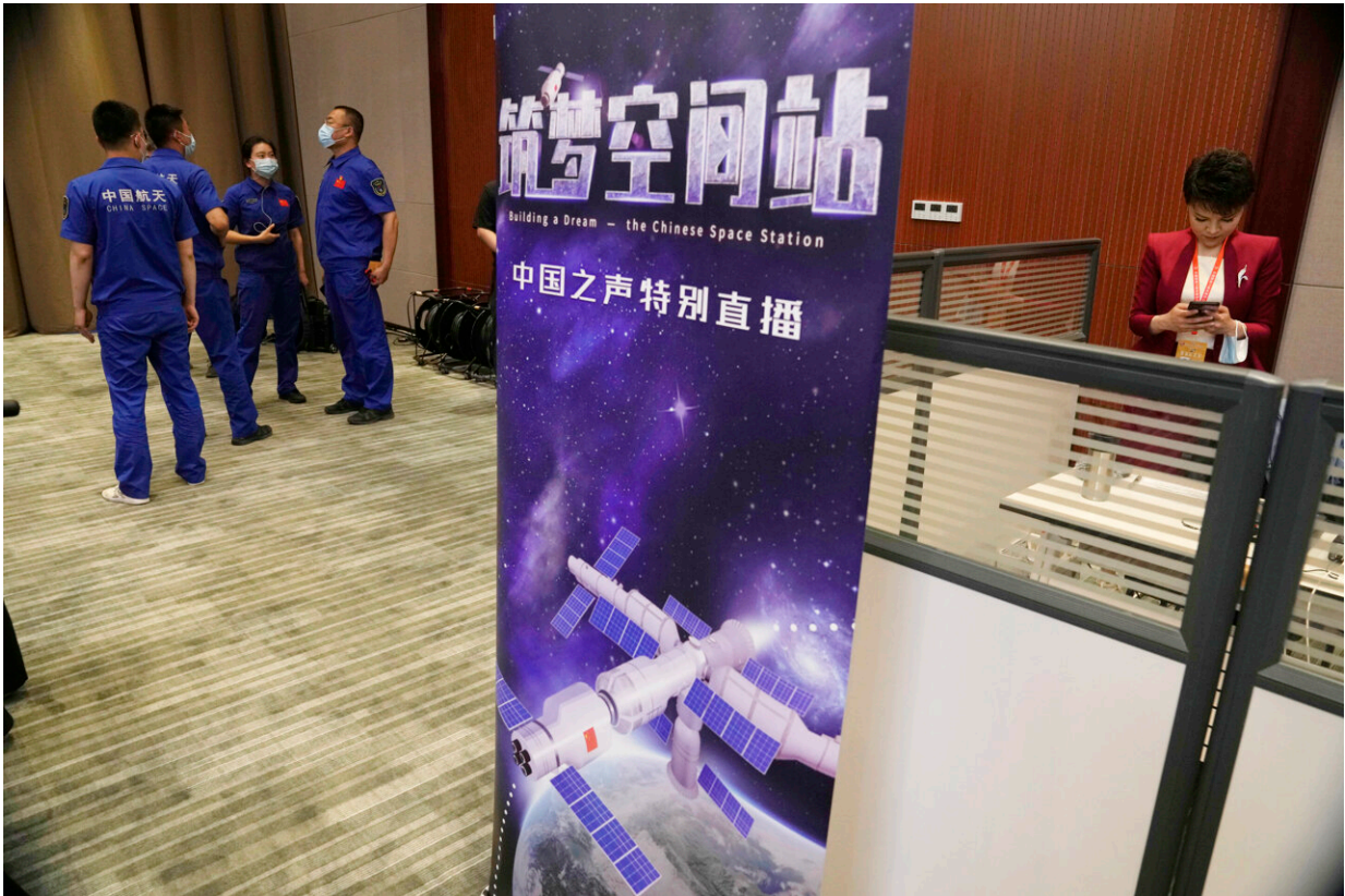
Workers prepare for the start of a press conference near a poster depicting the Chinese space station held at the Jiuquan Satellite Launch Center ahead of the Shenzhou-12 launch from Jiuquan in northwestern China's Gansu province on Wednesday, June 16, 2021.