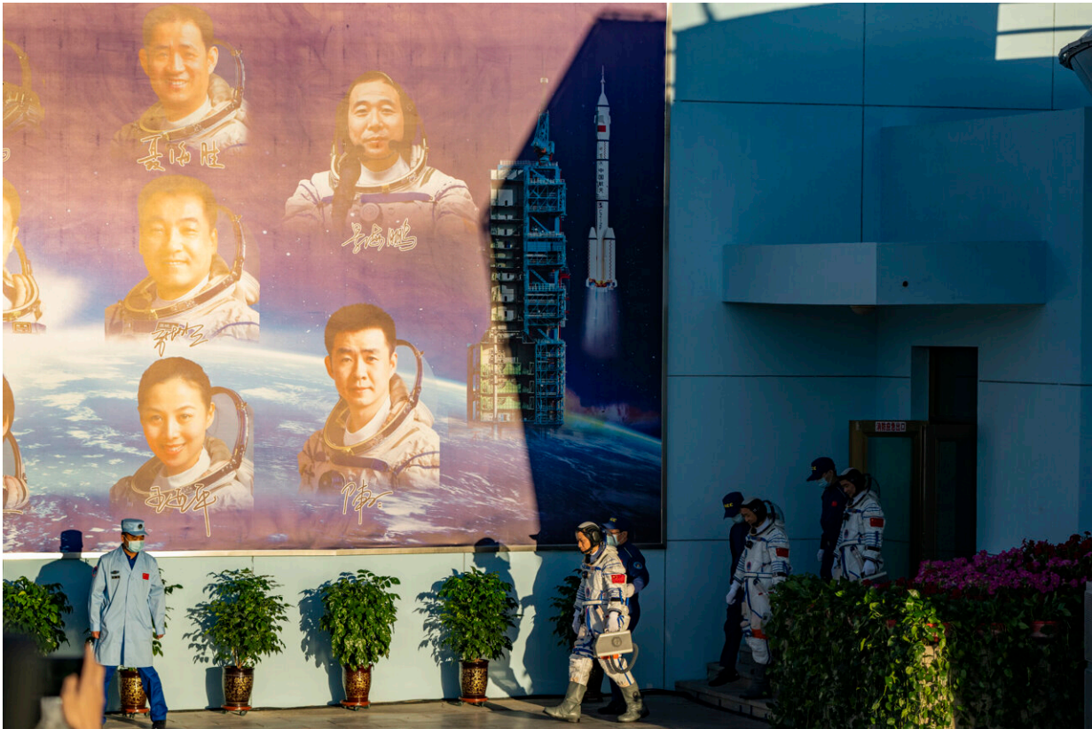
Chinese astronauts prepare to depart on the Shenzhou-12 mission at the Jiuquan Satellite Launch Center in Jiuquan in northwestern China, Thursday, June 17, 2021. Adding a crew to China's new orbiting space station is another major advance for the burgeoning space power.