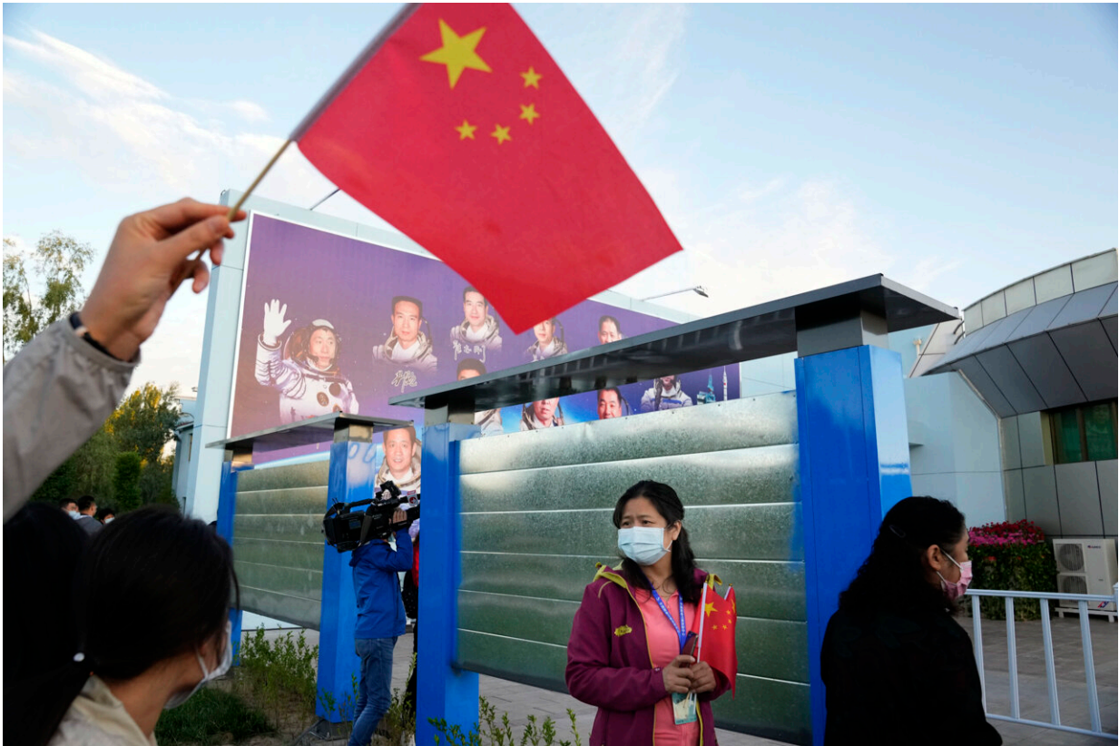
A woman holds up a Chinese flag near a board displaying China's astronauts at the Jiuquan Satellite Launch Center in Jiuquan in northwestern China, Thursday, June 17, 2021. China has launched the first three-man crew to its new space station in its ambitious programs first crewed mission in five years.