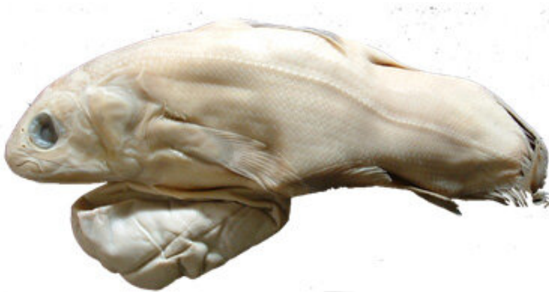
A coelacanth embryo with yolk sac from the MNHN collection.

While earlier studies relied on more readily visible calcified structures called macro-circuli to age the coelacanths much as counting growth rings can age a tree, the new approaches allowed the researchers to pick up on much tinier and nearly imperceptible circuli on the scales. Their findings suggest that the coelacanths actually are about five times older than was previously thought.