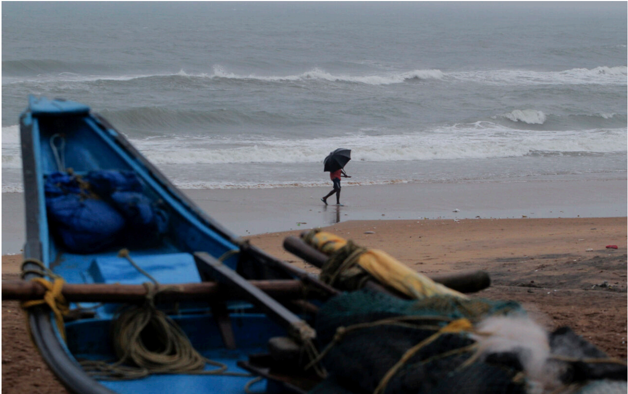
A man walks holding an umbrella during a drizzle at the Puri beach on the Bay of Bengalcoast in Odisha, India, Monday, May 24, 2021. Cyclone Yaas was forecast to hit the eastern states of West Bengal and Odisha on Wednesday.