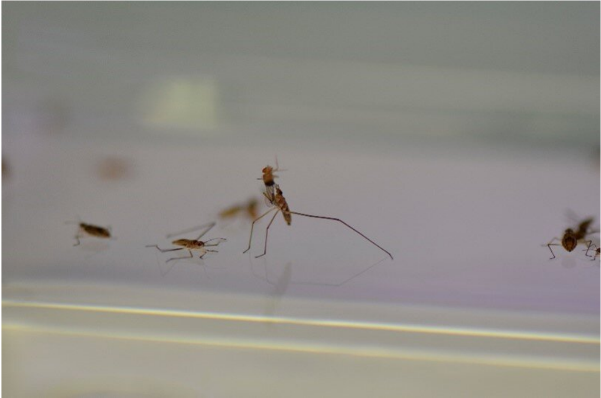
A large male monopolizing a prey (fly)