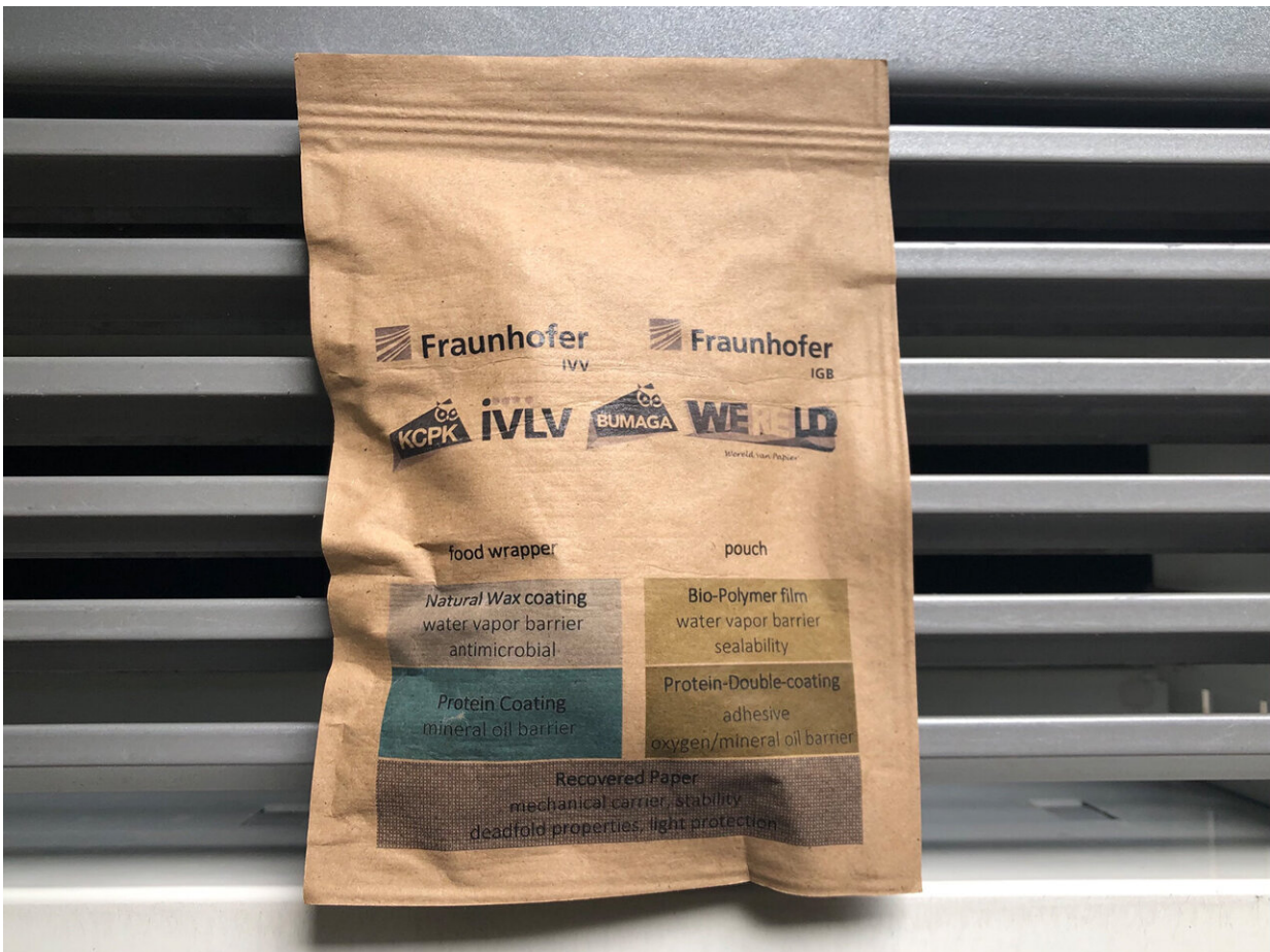
Fig. 1: A resealable bag made of paper with the coating on the inside. After use, the packaging is placed in the waste paper recycling bin with the bioactive materials.