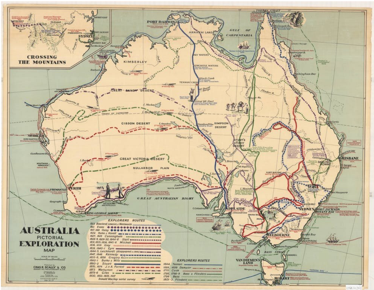
Early routes of European explorers in Australia.

These Aboriginal exchange routes and the relatively recent trade routes of early Europeans cannot be used directly to validate a map from tens of thousands of years ago. But there are strong similarities that might suggest an extraordinary persistence of routes across the entire time period of human occupation of Australia.