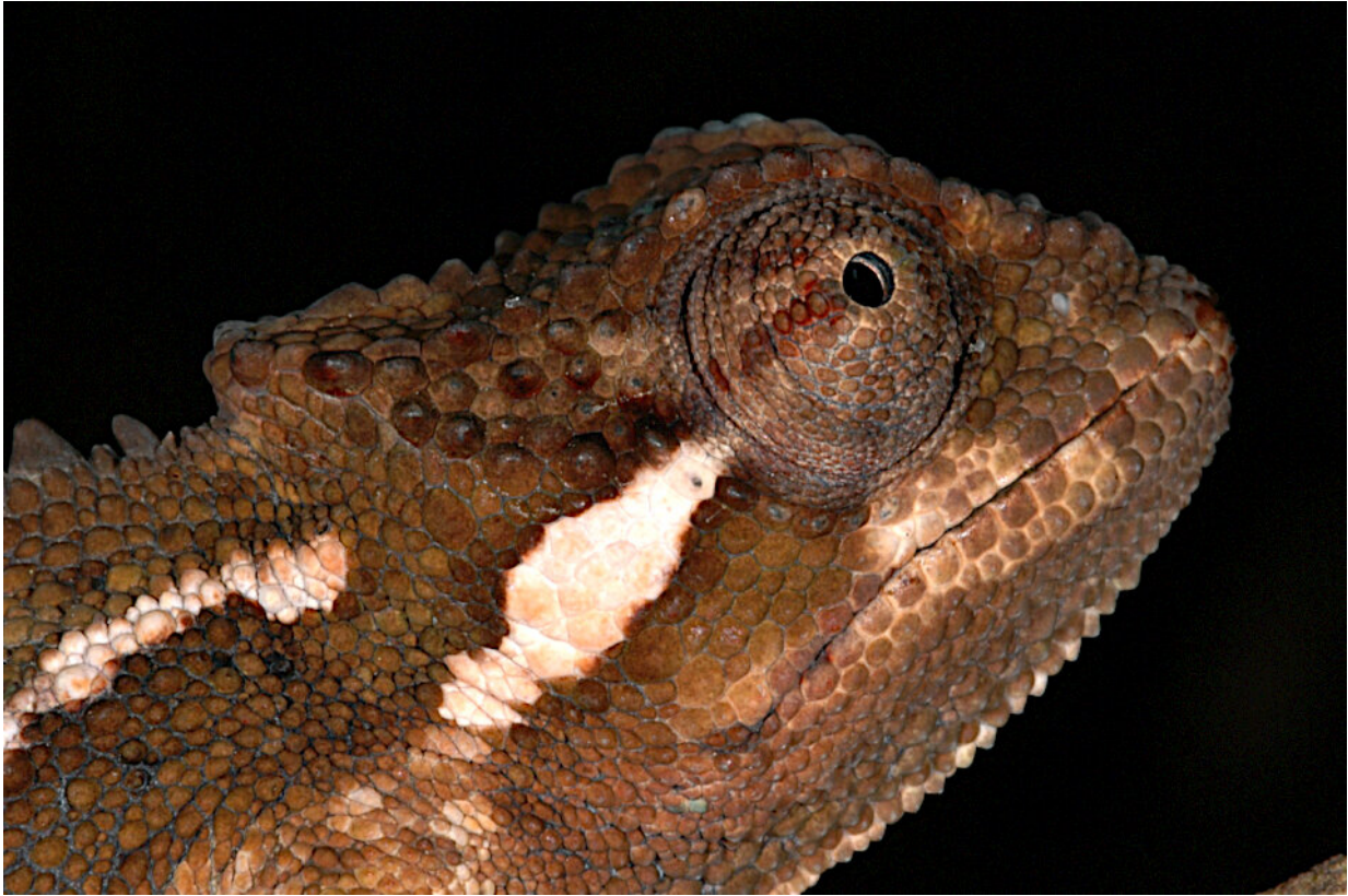
Head detail of the new chameleon, Trioceros wolfgangboehmei .

Apart from its biogeographical patterns, the new species also has a characteristic appearance, displaying enlarged spiny scales on its back and tail that form a prominent crest. It usually lives on small trees and bushes at an altitude of above 2,500 m above sea level.