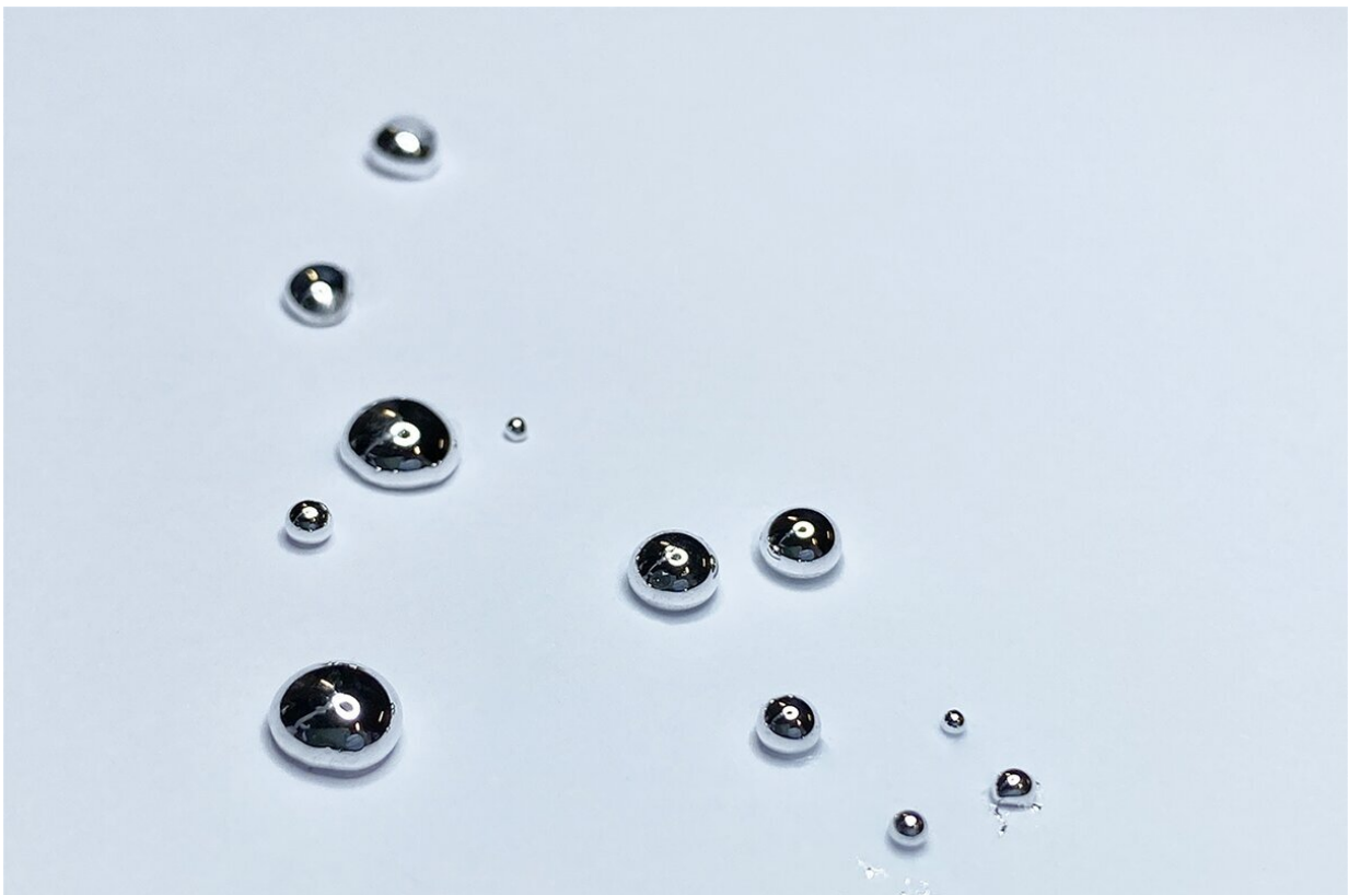
Figure 1: The droplets of gallium liquid metal.

While it is fascinating that living creatures develop distinct patterns on their skin, what may be even more mysterious is their striking similarity